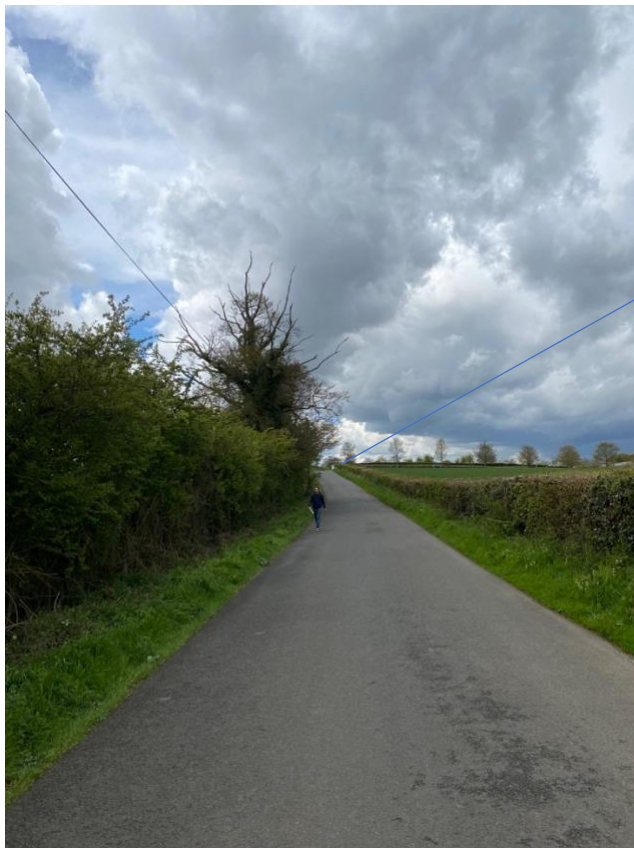
Photo taken from 160m from site entrance and Farm Shop 'A' board which is 2.4m being junction line clear in view.