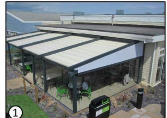
1 New pergola , covered external seating area with retractable roof to extend indoor restaurant (4m wide). See detail A.