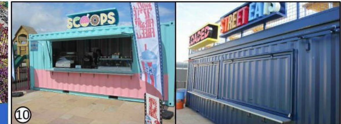
10 Street Eats & Scoops One standard 40 ft. shipping container divided in half for ice cream stall and food takeaway.