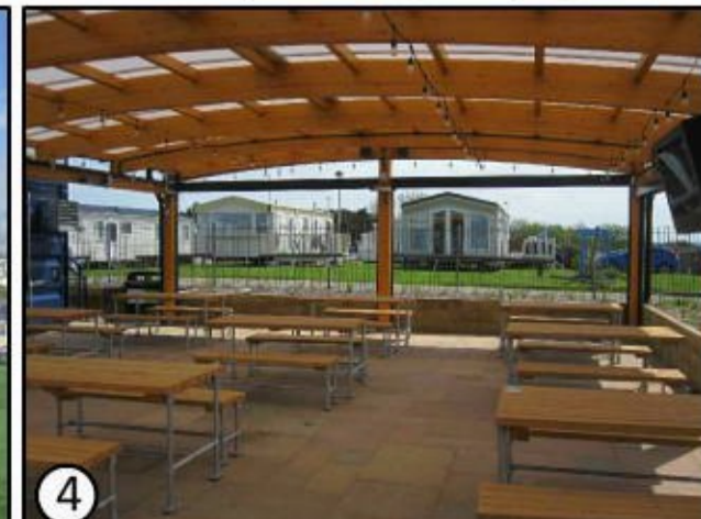
4 New able structure , (14x9m) covered external seating area. See detail C.