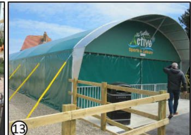
13 New Archery Tent (15x7m) See detail E.