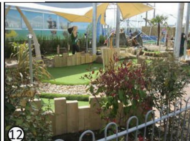
12 Adventure Golf - pirate themed 9 hole adventure golf. Final design to be prepared by specialist manufacturer.