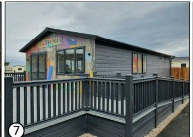
7 Arts and Crafts Den (14x6.3m lodge) See detail D.