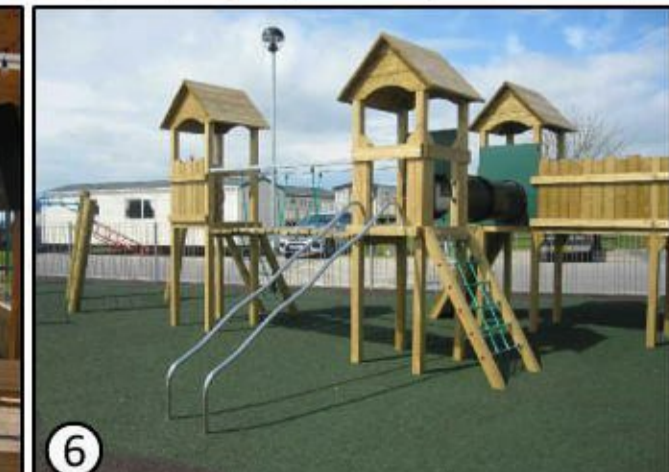
6 Enhanced Kids Play Area New wetpour rubber surface, some existing equipment to be reused and some new play equipment to be installed.