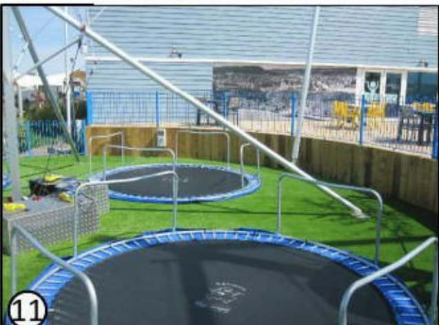
11 Bungee Trampolines (13m dia.)