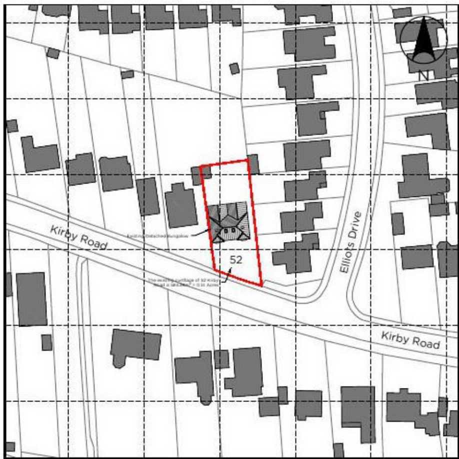
1.1 Existing Site Location Plan Scale 1:1250