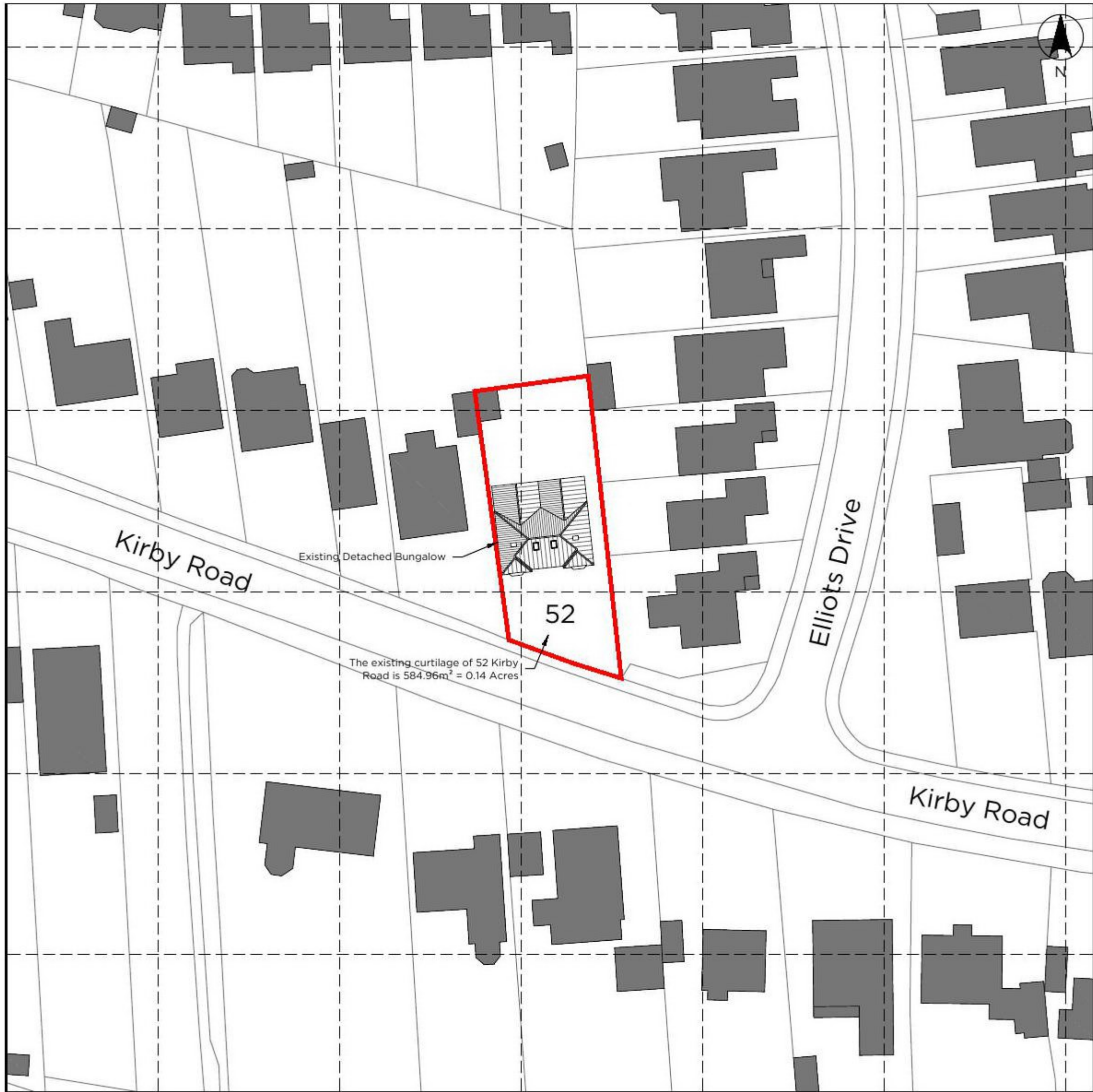
1.2 Existing Block Plan Scale 1:500