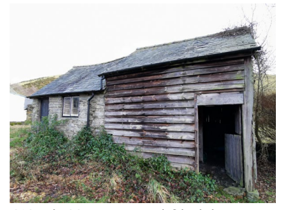
Wash House and Stable