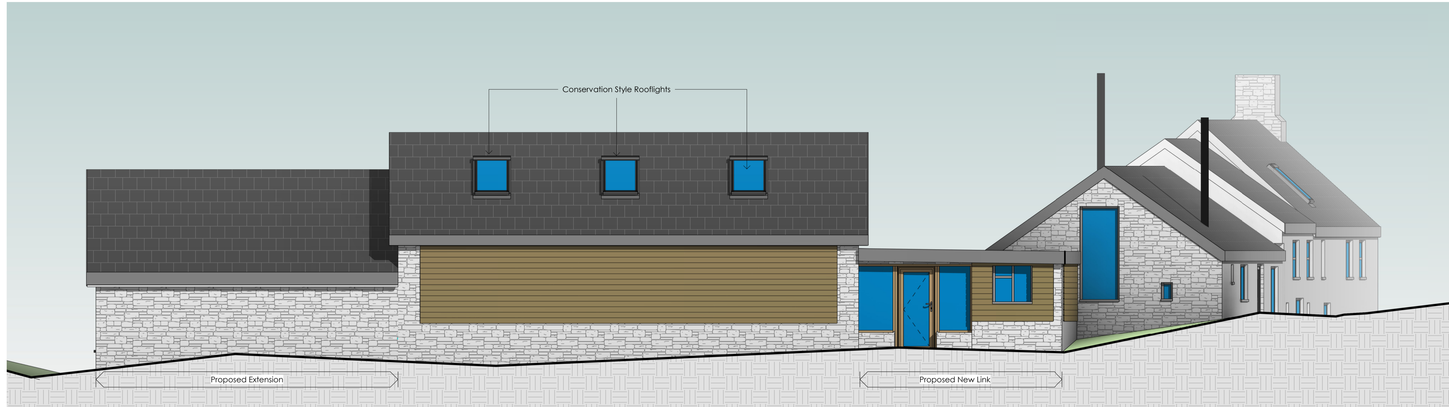
1 Wide North Elevation 1:50