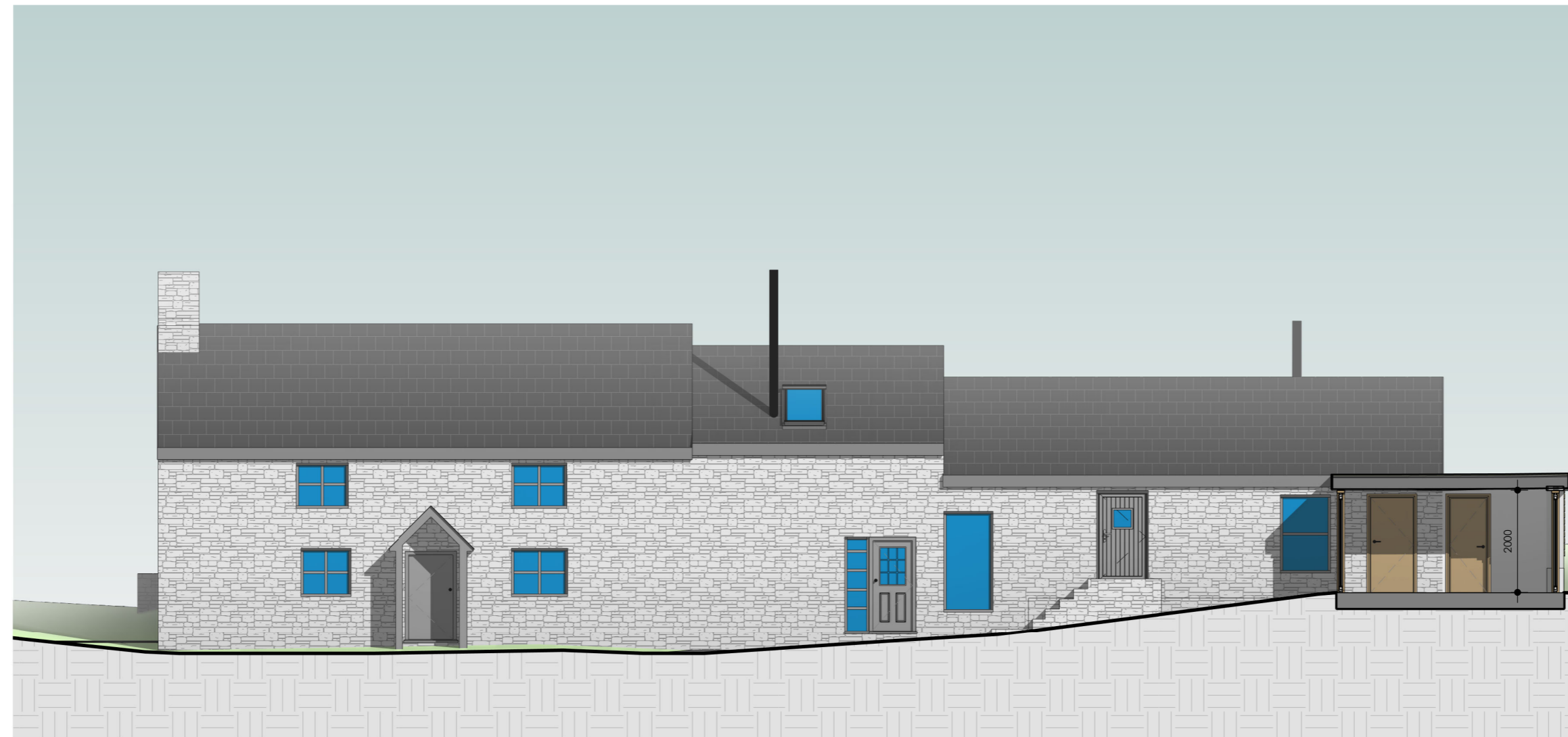
2 Front Elevation 1 : 100