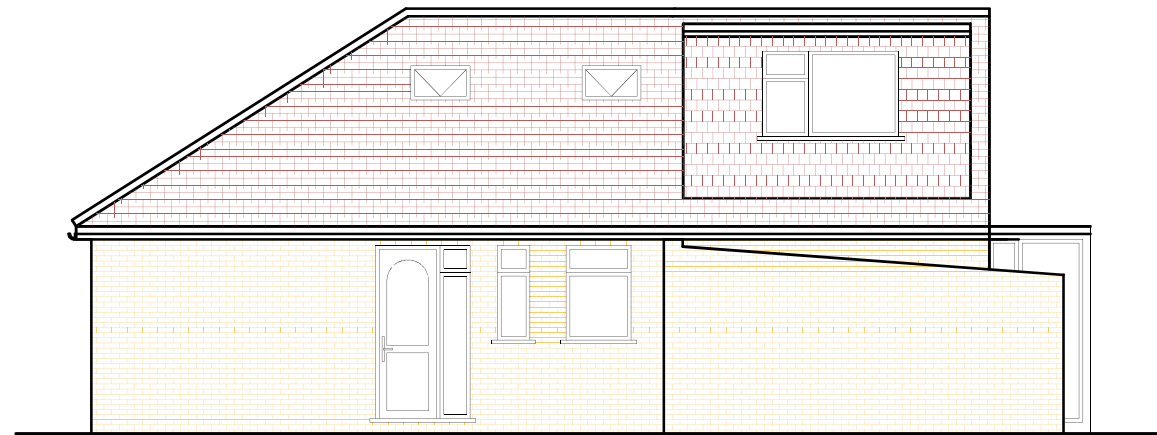
Existing Side Elevation - B