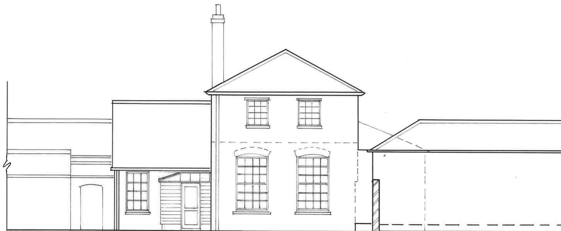
NORTH ELEVATION SHOWING PROPOSED EXTERNAL TIMBER PORCH