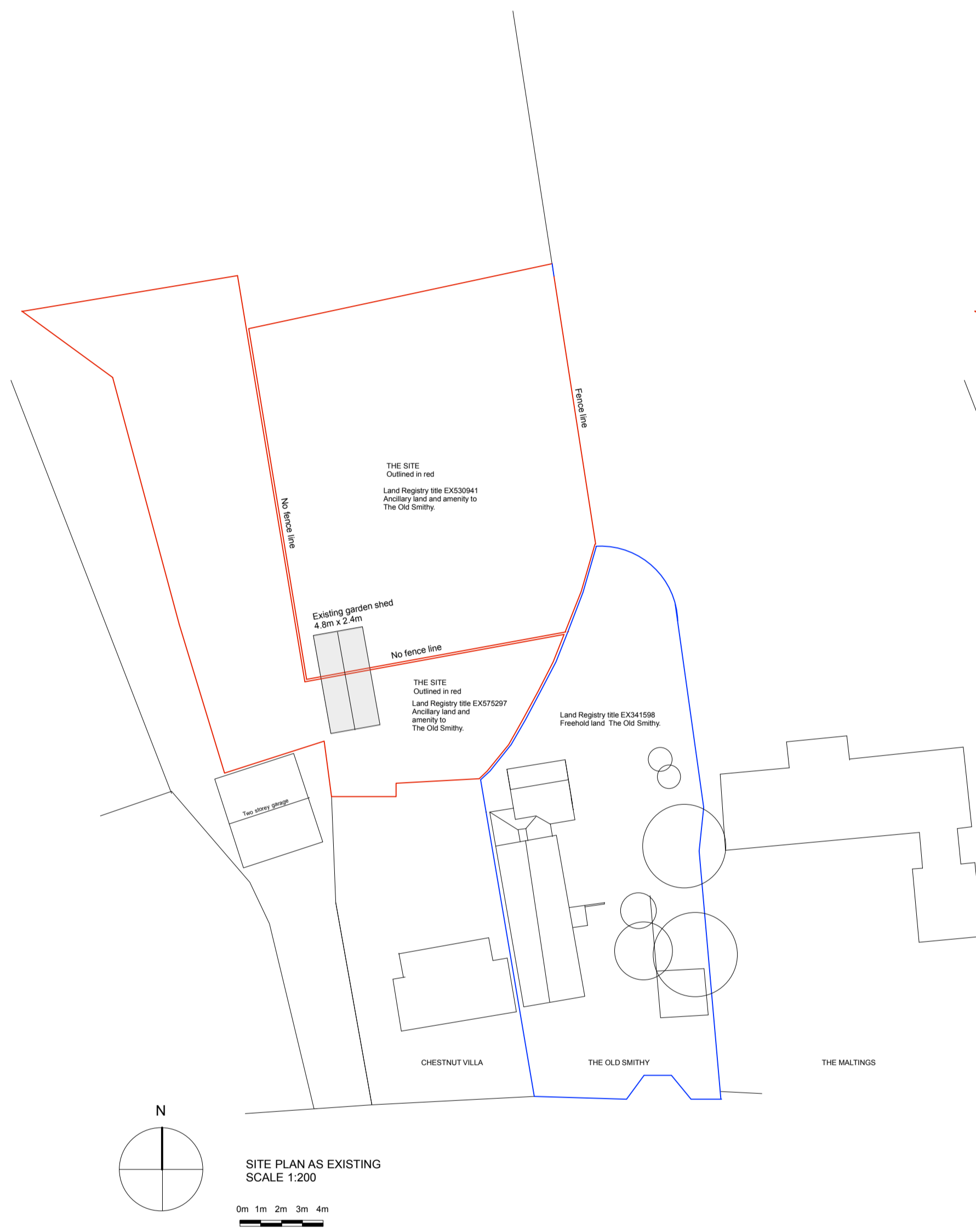
SITE PLAN AS EXISTING SCALE 1:200