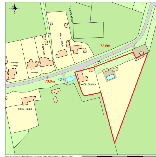
location plan scale 1:1250

This Plan includes the following Licensed Data: OS MasterMap Colour PDF Location Plan by the Ordnance Survey National Geographic Database and incorporating surveyed revision available at the date of production. Reproduction in whole or in part is prohibited without the prior permission of Ordnance Survey. The representation of a road, track or path is no evidence of a right of way. The representation of features, as lines is no evidence of a property boundary. © Crown copyright and database rights, 2020. Ordnance Survey 0100031673