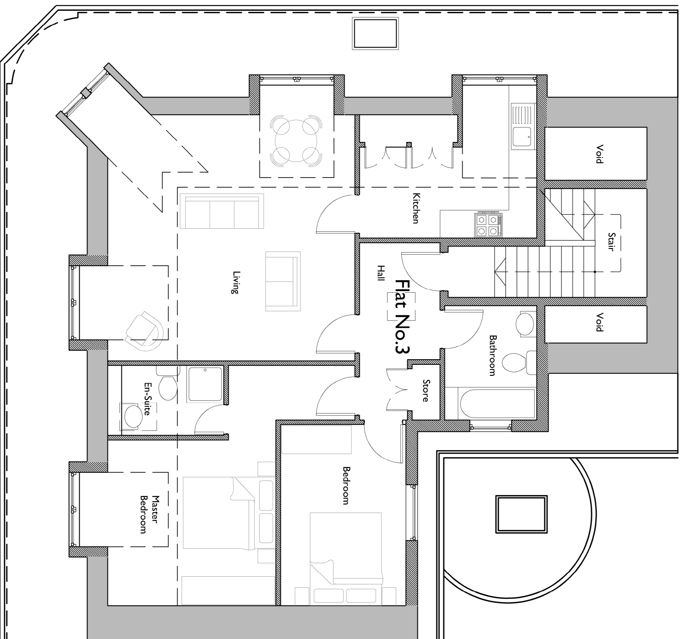
Second Floor Plan as Proposed @1:50