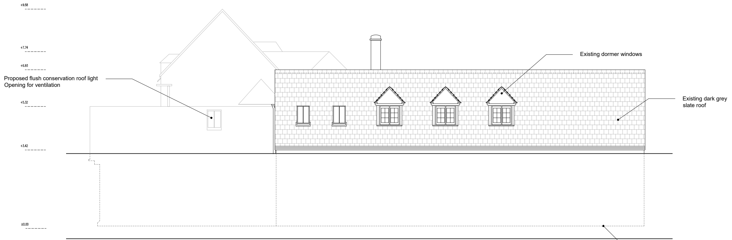
WYCHWOOD LODGE - PROPOSED EAST ELEVATION SCALE 1:100@A3