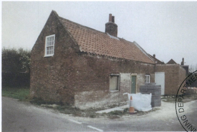
PHOTO OF COTTAGE IN APRIL 2003 ,SHOWING BUILDING UNDER CONSTRUCTION

The listing report, (set out below), describes the building as late-seventeenth century with nineteenth century alterations, although it does not elaborate on what the nineteenth century alterations comprise or how they are to be observed.