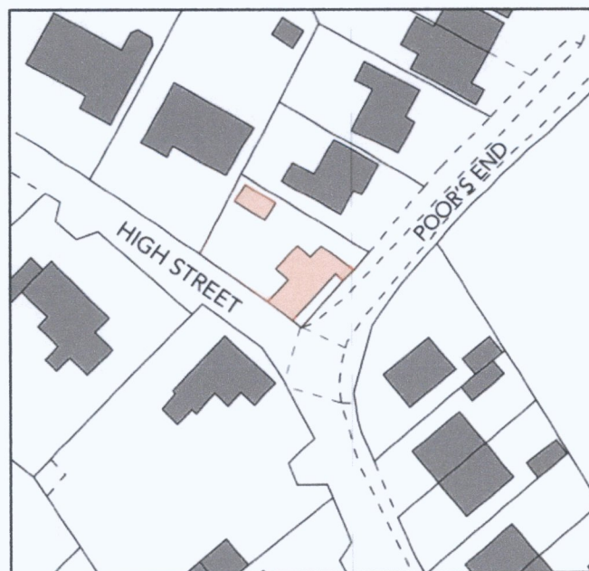
MODERN MAP SHOWING LOSS OF 'BREATHING SPACE'

Modern development around the building has not benefitted the cottage. The 1888 Ordnance Survey map shows the cottage to be one of a pair of buildings occupying a large site of over an acre surrounded by a drainage ditch. The modern map shows the second building removed and new buildings encroaching on the cottage in all directions.