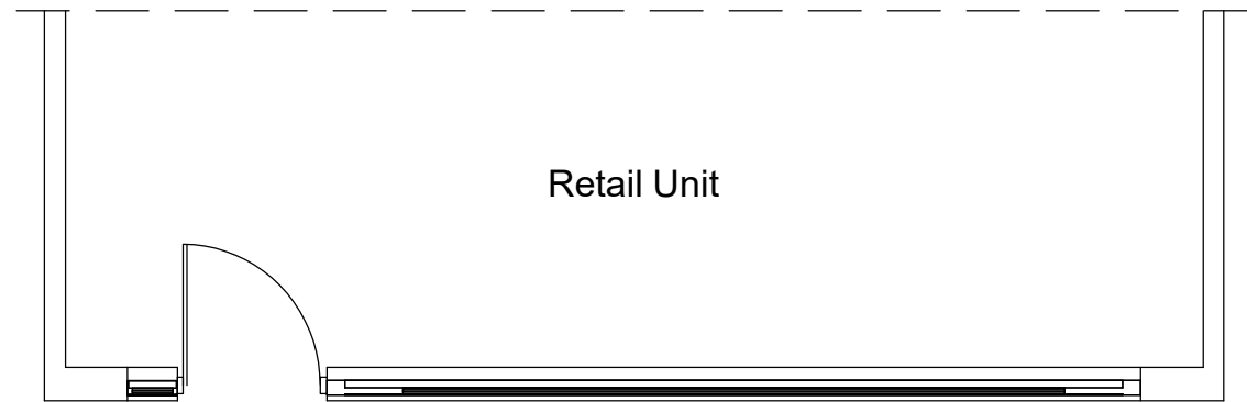
EXISTING GF LAYOUT Scale 1:50

REV/NOTES: Where building to the boundaries the adjacent owner is to be informed under the terms of the Party Wall Act 1996 and its provisions followed. Where building over boundaries the adjacent owner is to be served notice under section 65 of the Town & Country Planning Act 1990. © This drawing and the works depicted are the copyright of GT Designz LTD and may not be reproduced or amended except by written permission of GT Designz LTD.