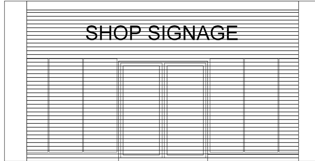
PROPOSED FRONT ELEVATION Shutter down Scale 1:50