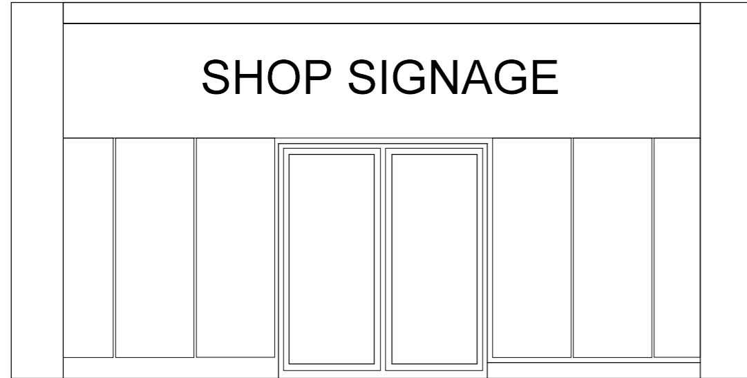
PROPOSED FRONT ELEVATION Shutter up Scale 1:50