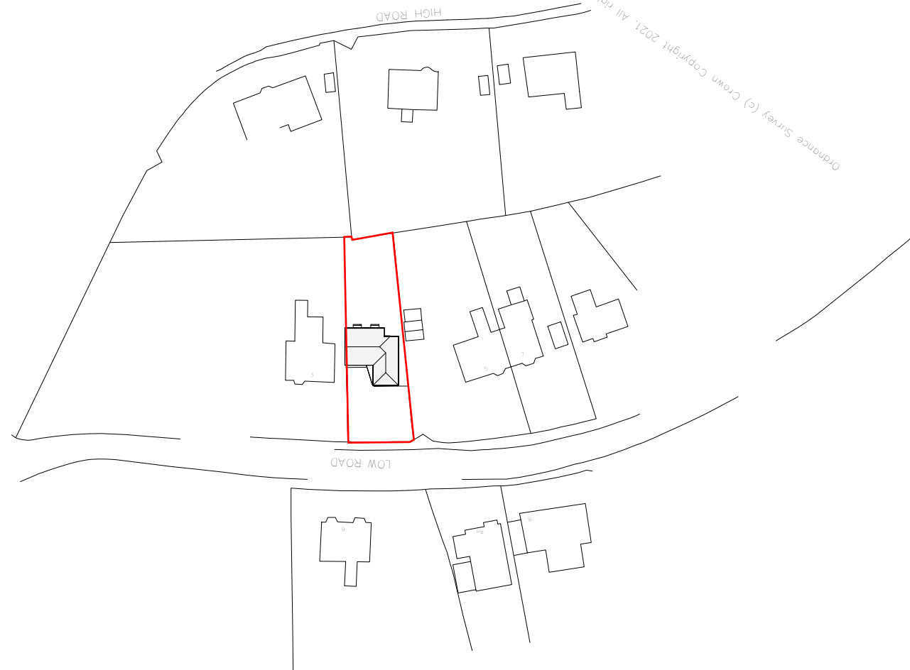
Location Plan 1 : 1250

Orange Survey (c) Crown Copyright 2021. All rights reserved. Licence number 100022432