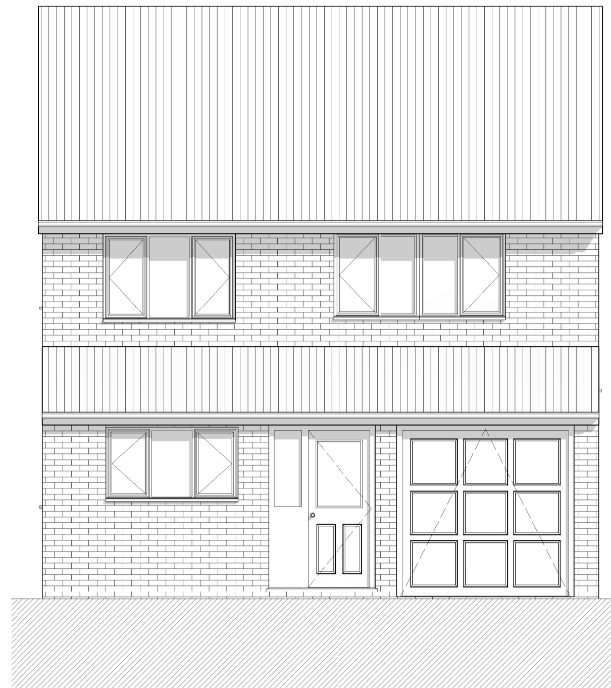
1 Proposed Front Elevation 1 : 50