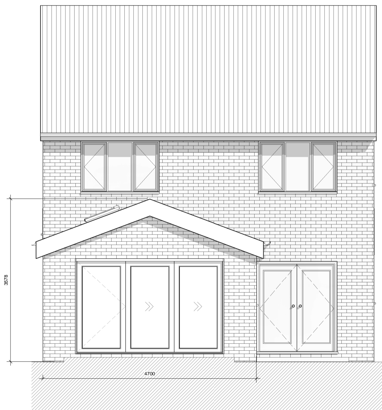
2 Proposed Rear Elevation 1 : 50