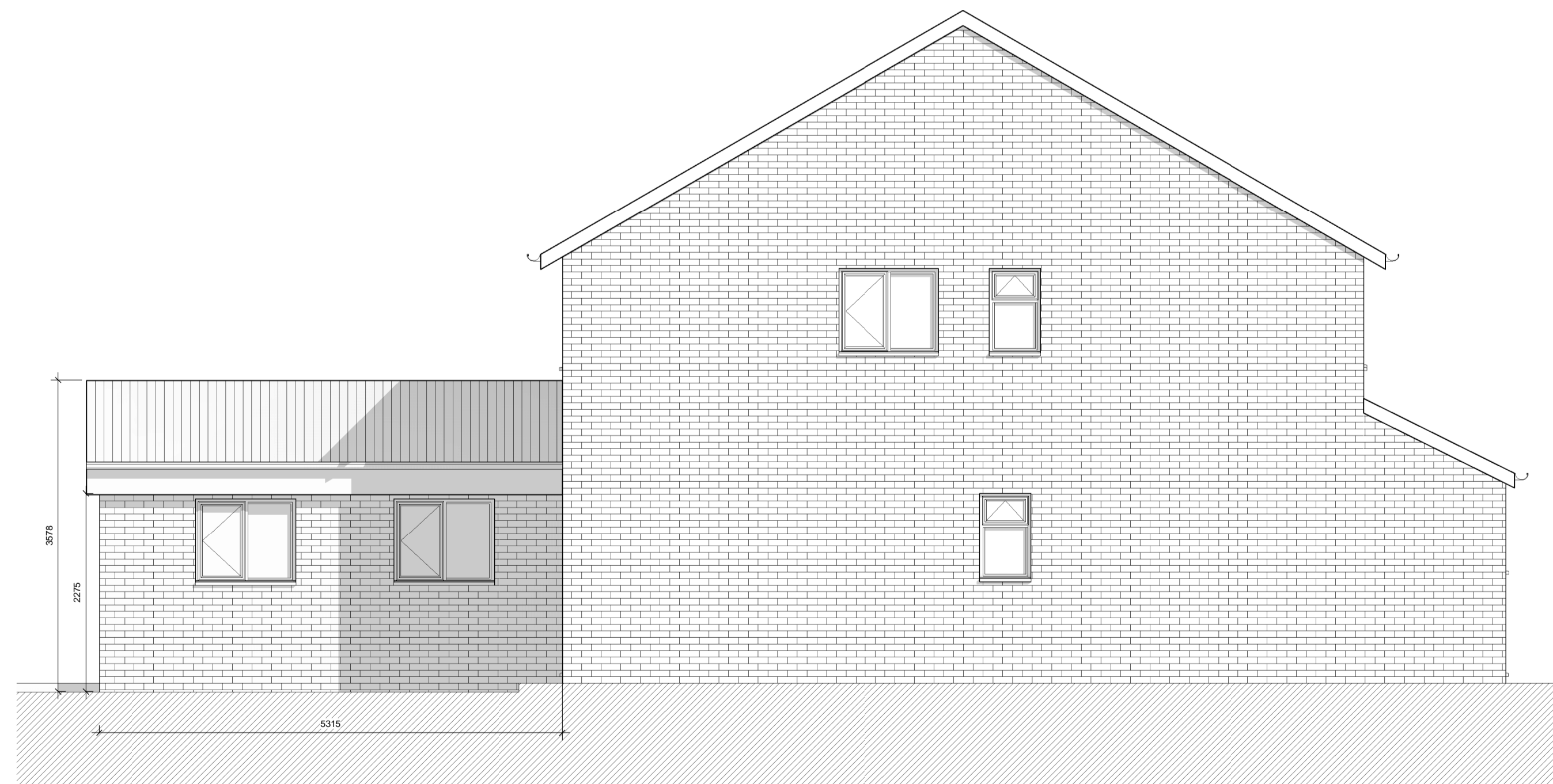
4 Proposed Side Elevation 2 1 : 50

NOTES: THIS DRAWING IS INDICATIVE ONLY AND MUST NOT BE REPRODUCED WITHOUT PERMISSION. THIS DRAWING IS FOR PLANNING PURPOSES ONLY AND MUST NOT BE USED FOR ANY OTHER PURPOSES. THE CONTRACTOR IS RESPONSIBLE FOR CHECKING DIMENSIONS ON SITE PRIOR TO BUILDING OR FABRICATION.