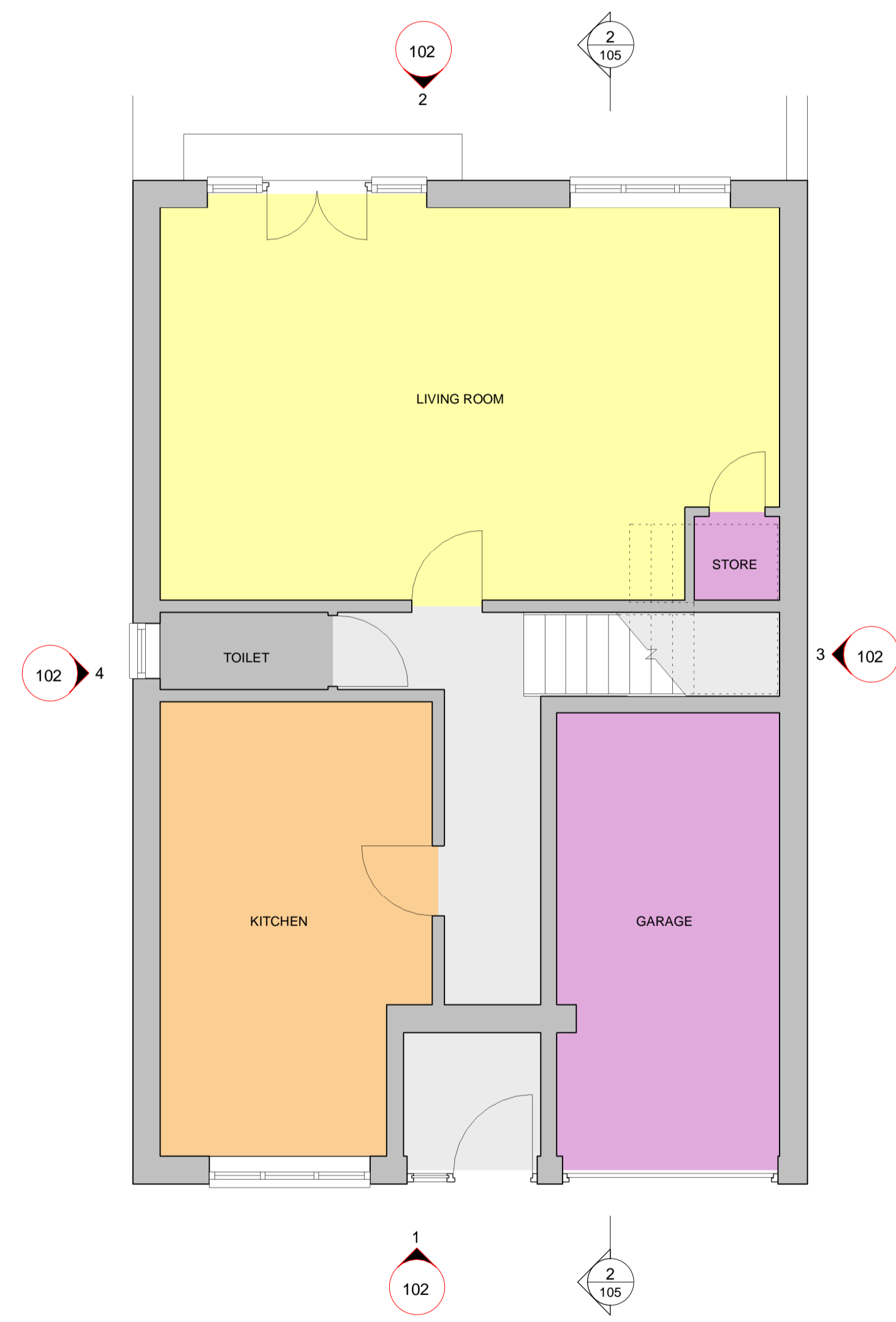
1 Existing Ground floor plan 1 : 50