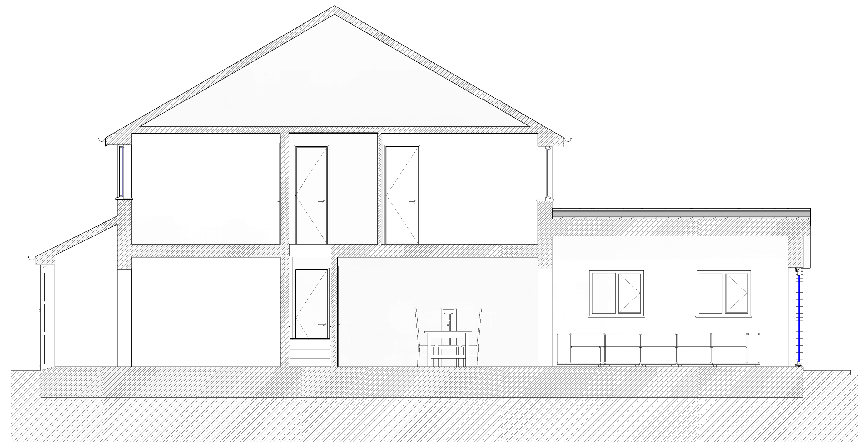
1 Proposed Section 1 : 50

NOTES: THIS DRAWING IS INDICATIVE ONLY AND MUST NOT BE REPRODUCED WITHOUT PERMISSION. THIS DRAWING IS FOR PLANNING PURPOSES ONLY AND MUST NOT BE USED FOR ANY OTHER PURPOSES. THE CONTRACTOR IS RESPONSIBLE FOR CHECKING DIMENSIONS ON SITE PRIOR TO BUILDING OR FABRICATION.