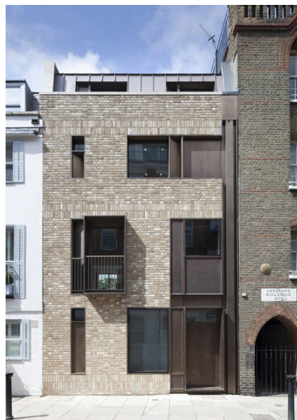
Stacked brick detailing