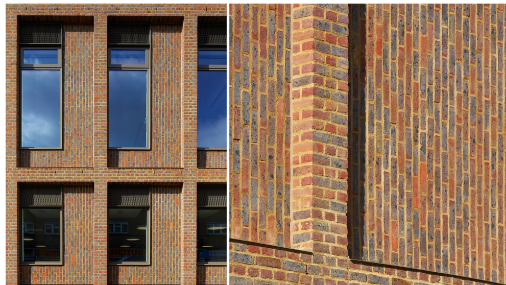
Brick and mortar colouring