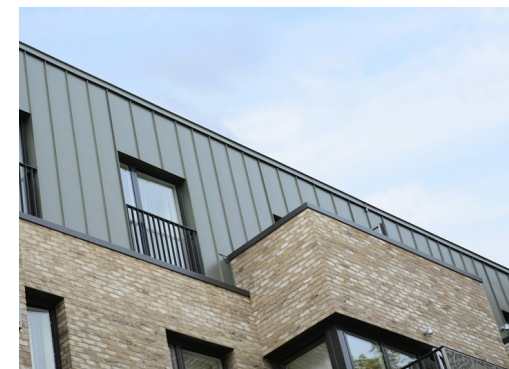
Zinc cladding and roofing to top floors