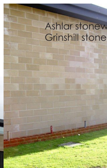
Ashlar stonework to lower block Grinshill stone