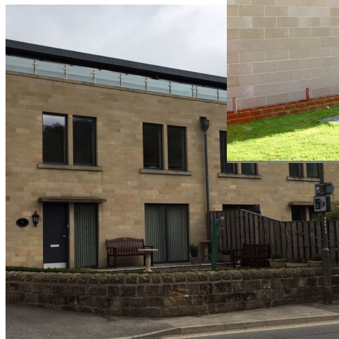
Residential development - Lord Hill Hotel - Shrewsbury Suggested material palette