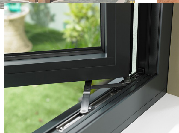
Windows and doors in RAL 7016