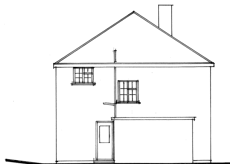
existing side elevation.