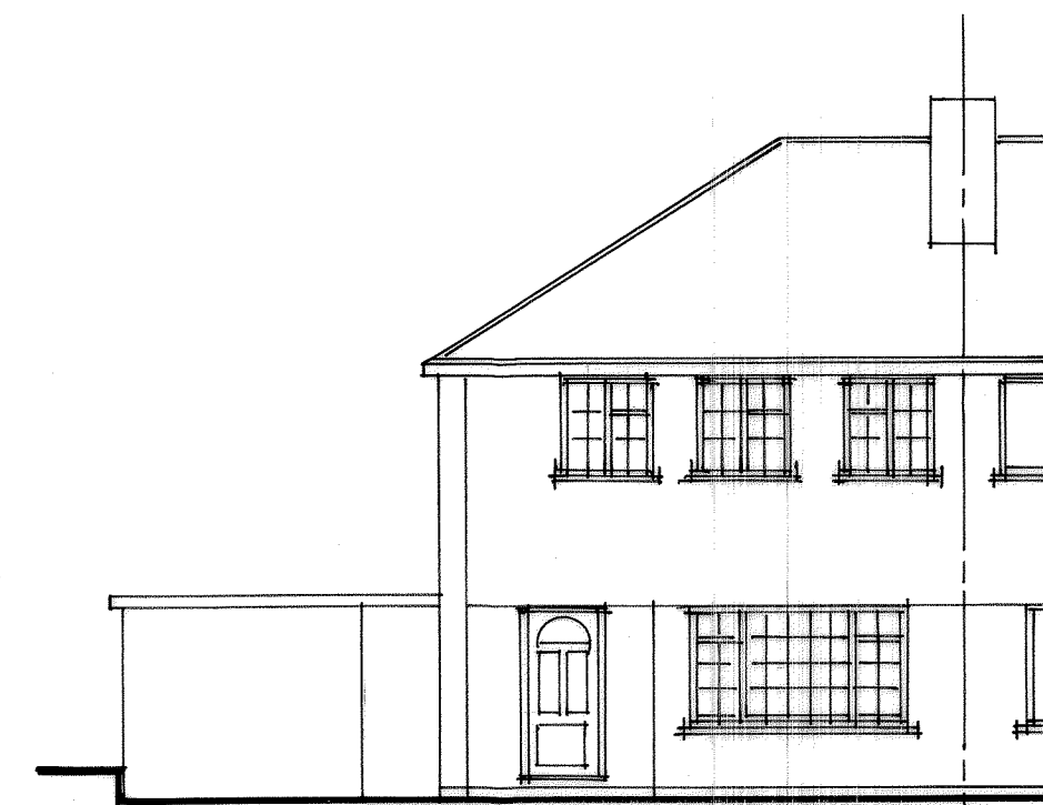
existing front elevation.