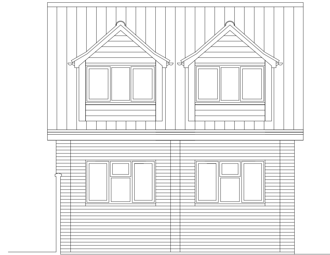
PROPOSED FRONT (SOUTH) ELEVATION SCALE 1:50