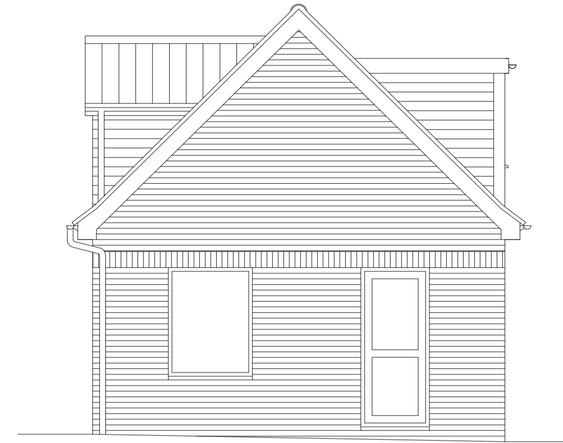
PROPOSED SIDE (EAST) ELEVATION SCALE 1:50