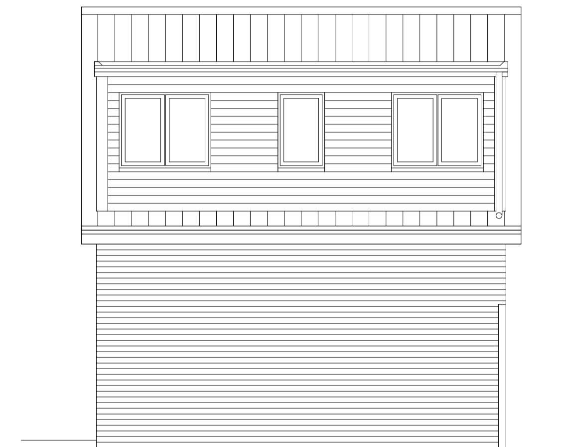
PROPOSED REAR (NORTH) ELEVATION SCALE 1:50