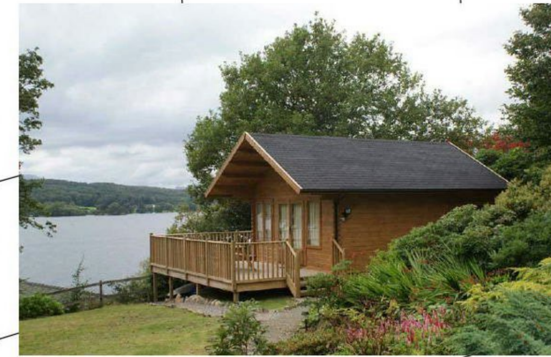
Example Photo of Proposed Lodge