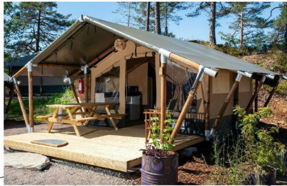
Example Photo of Proposed Safari Lodge