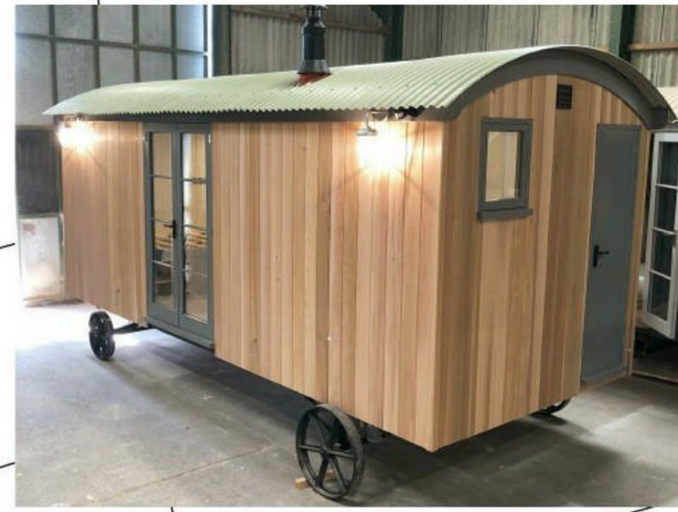
Example Photo of Proposed Shepherd Hut