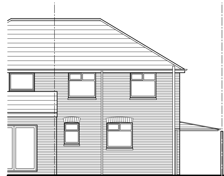
EXISTING REAR ELEVATION (1:100)