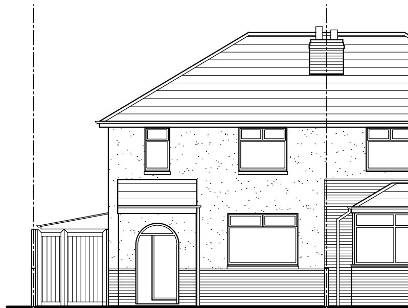
EXISTING FRONT ELEVATION (1:100)