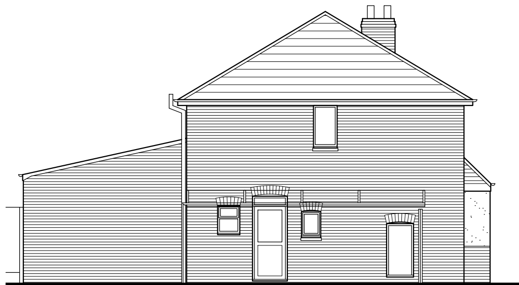
EXISTING SIDE ELEVATION TO No. 11 (1:100)