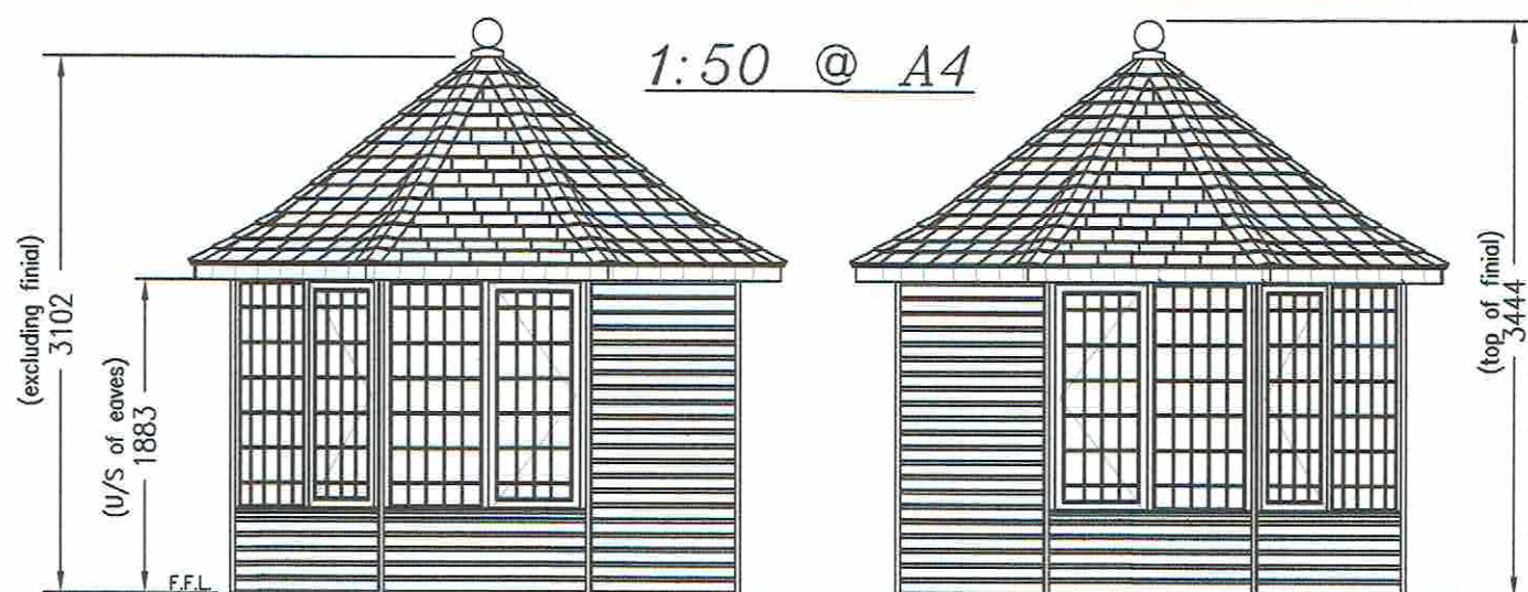
SOUTH EAST FACING ELEVATION