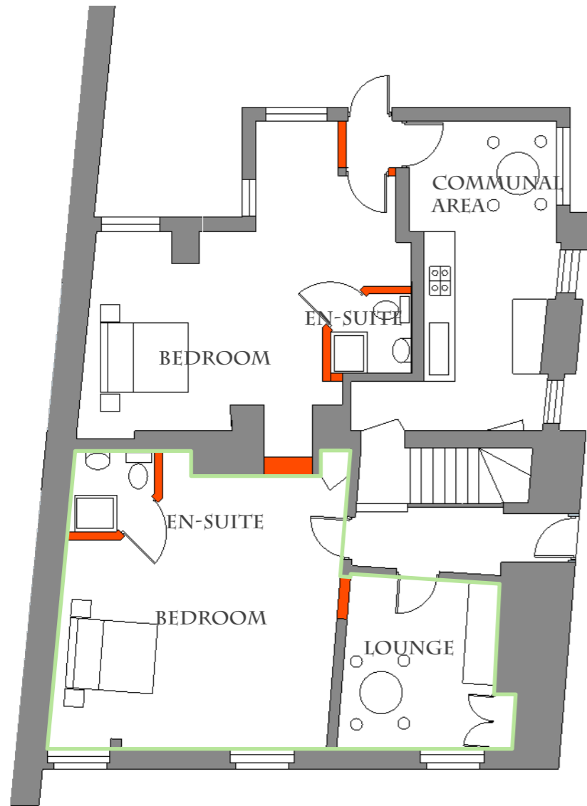
A Ground Floor 6 1:100