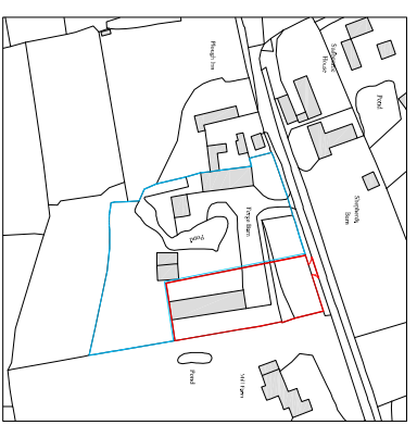
Location Plan Scale: 1:1250