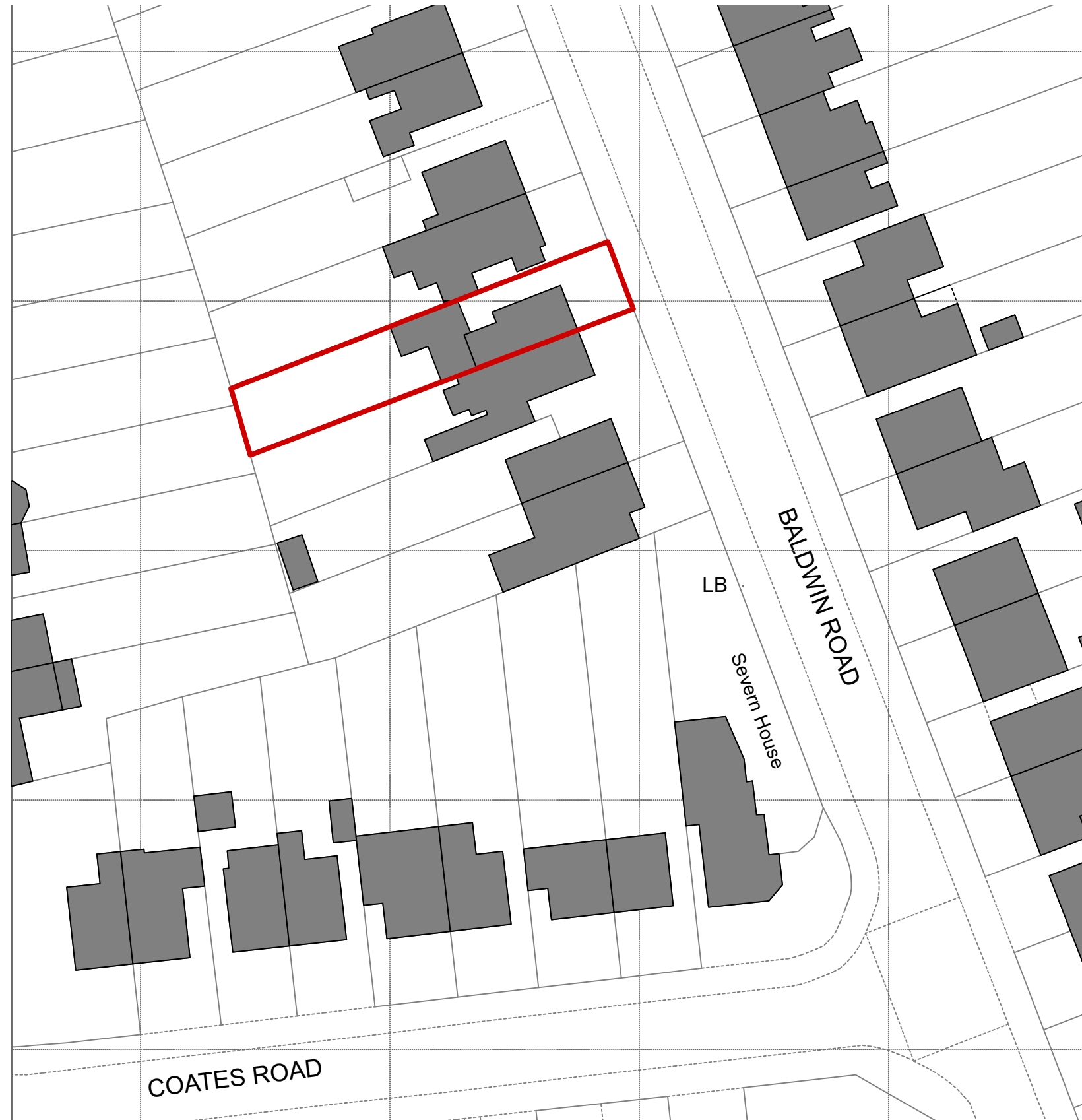
2 PROPOSED SITE BLOCK PLAN 1:500 @ A3