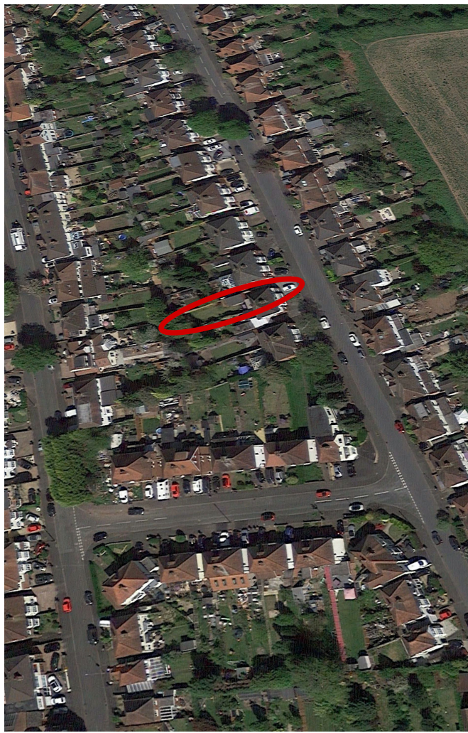
3 AERIAL VIEW Not to scale