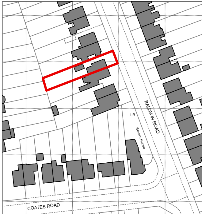
1 LOCATION PLAN 1:1250 @ A3