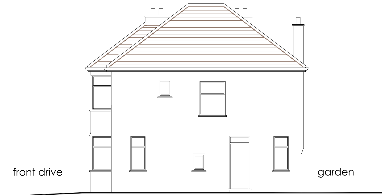
Flank Elevation (northwest)