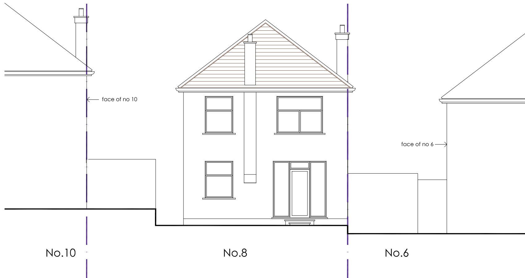
Rear Elevation (southwest)