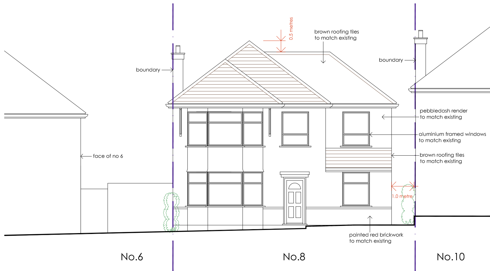
Front Elevation (northeast)