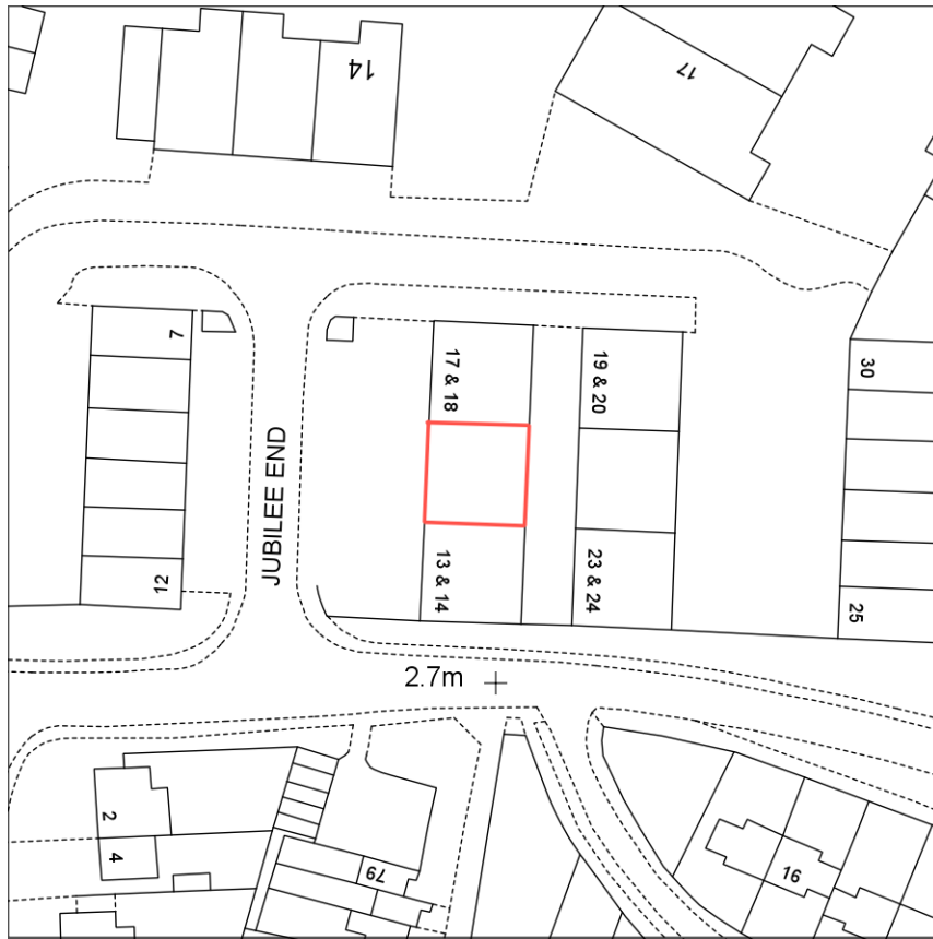
Antique, 15-16, Jubilee End, Lawford, Manningtree