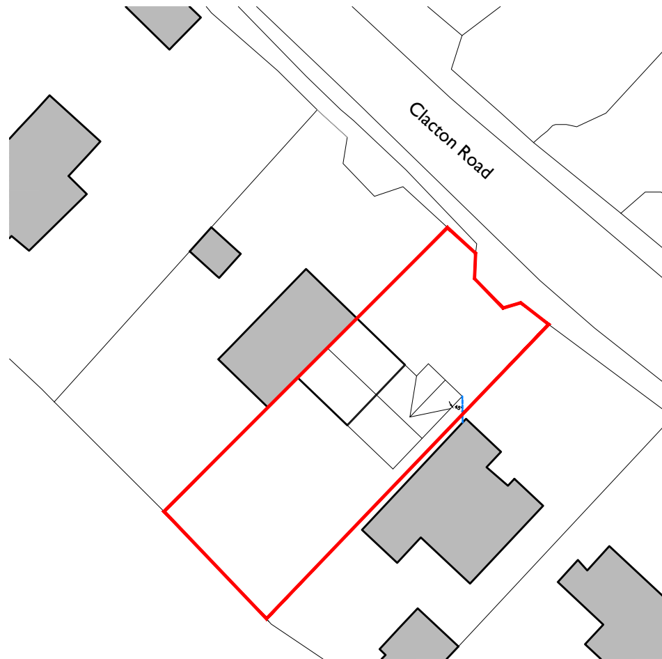
01/201 SITE LOCATION PLAN - AS PROPOSED