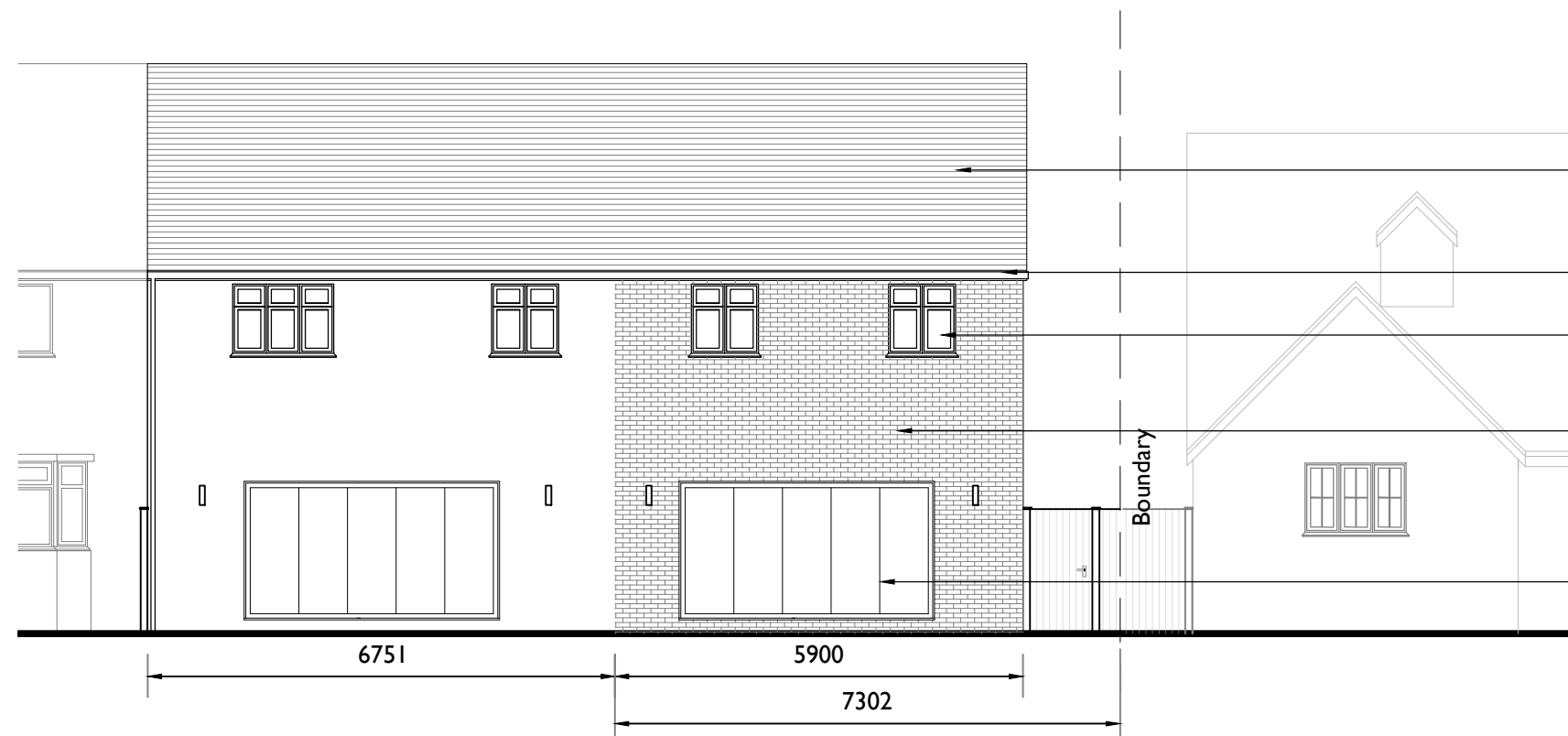
03/203 REAR ELEVATION - AS PROPOSED