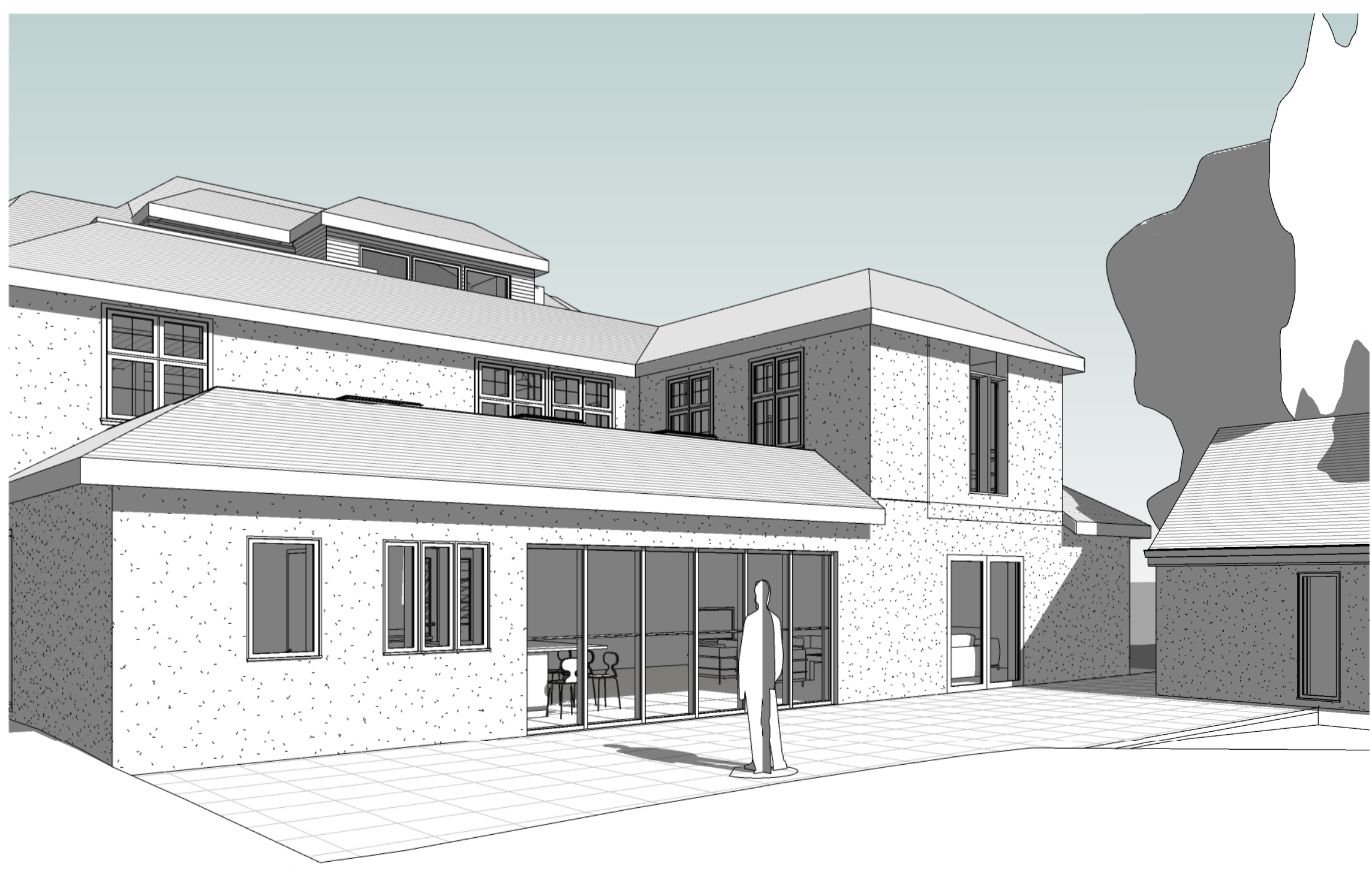
1 3D View 1