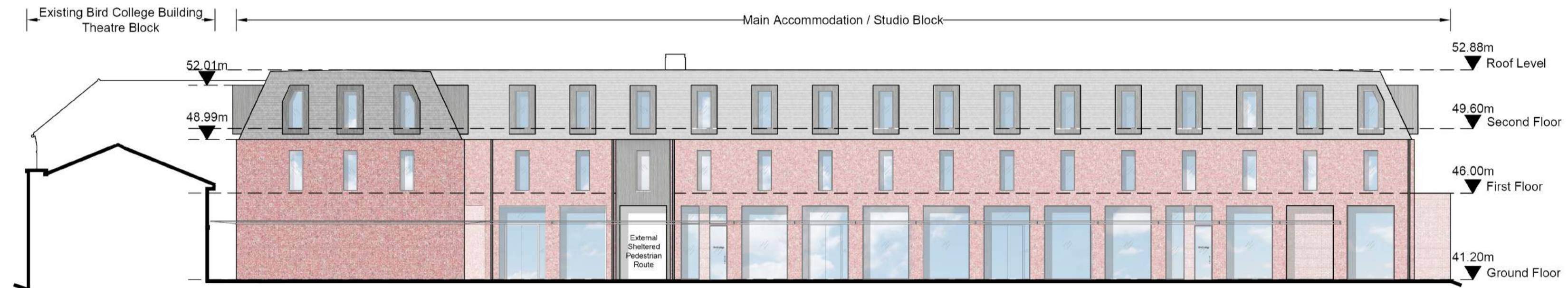
Elevation B 1:200 Scale

Proposed Development is a maximum of 600mm higher (except the theatre plant which is 1600mm higher) than the existing Bird College buildings and follows a similar footprint to the existing site layout and buildings.