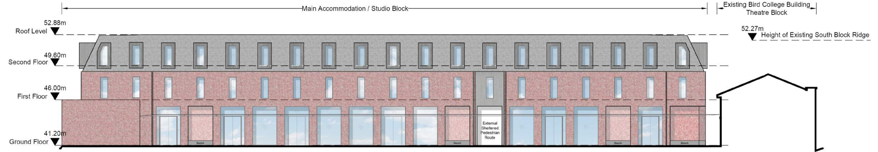
Elevation A 1:200 Scale

Proposed Development is a maximum of 600mm higher (except the theatre plant which is 1600mm higher) than the existing Bird College buildings and follows a similar footprint to the existing site layout and buildings.