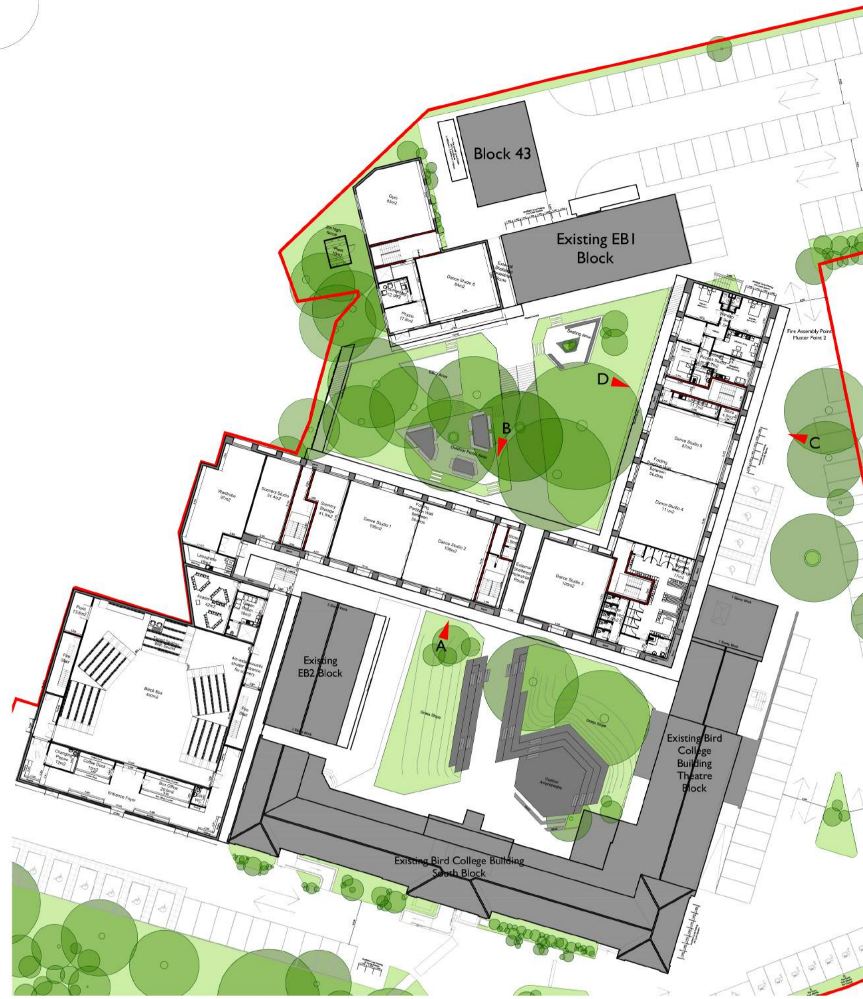
Site Plan 1:500 Scale