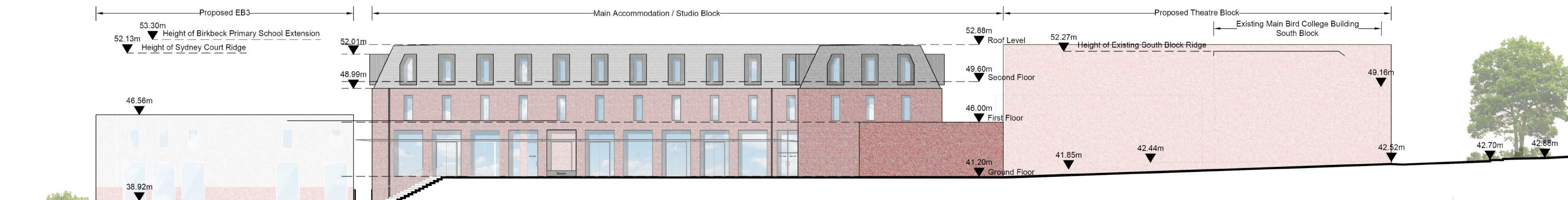
Elevation D 1:200 Scale