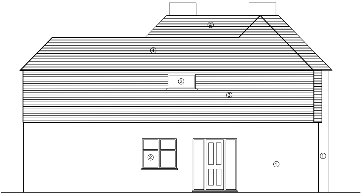
Proposed Side Elevation 1:100 @ A3