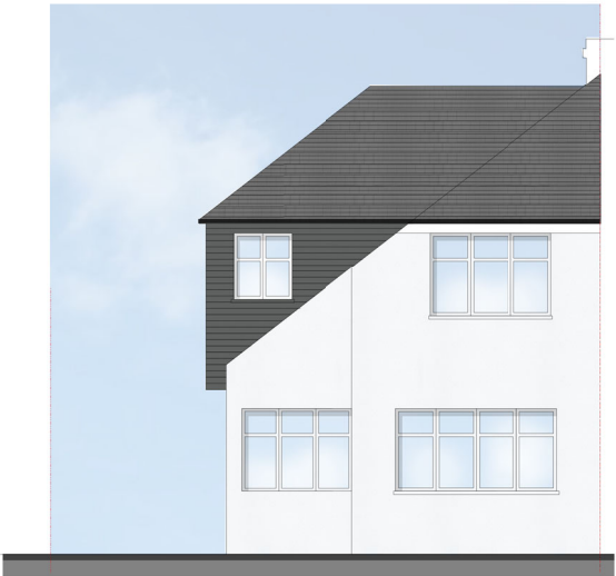
Illustrative Proposed Coloured Front Elevation N.T.S