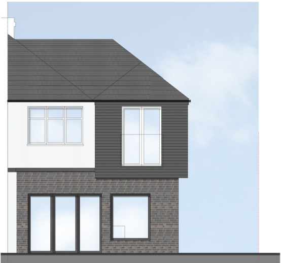
Illustrative Proposed Coloured Rear Elevation N.T.S