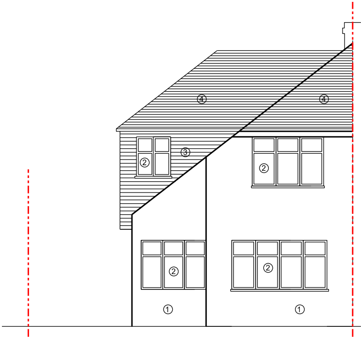
Proposed Front Elevation 1:100 @ A3

Notes: 1. Do not scale. Dimensions govern. 2. All dimensions are in millimetres unless noted otherwise. 3. All dimensions to be verified on site before proceeding with the work. 4. The designer shall be notified in writing of any discrepancies.