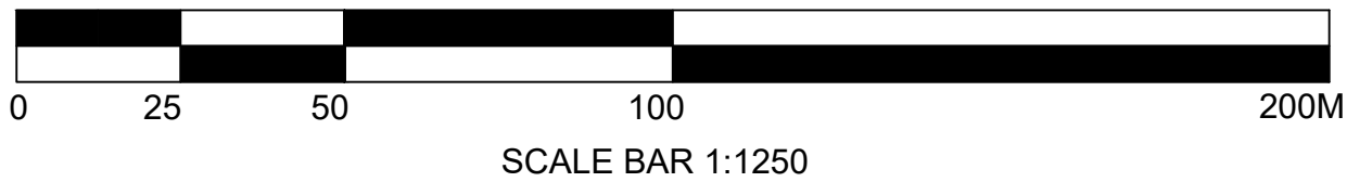
SCALE BAR 1:1250