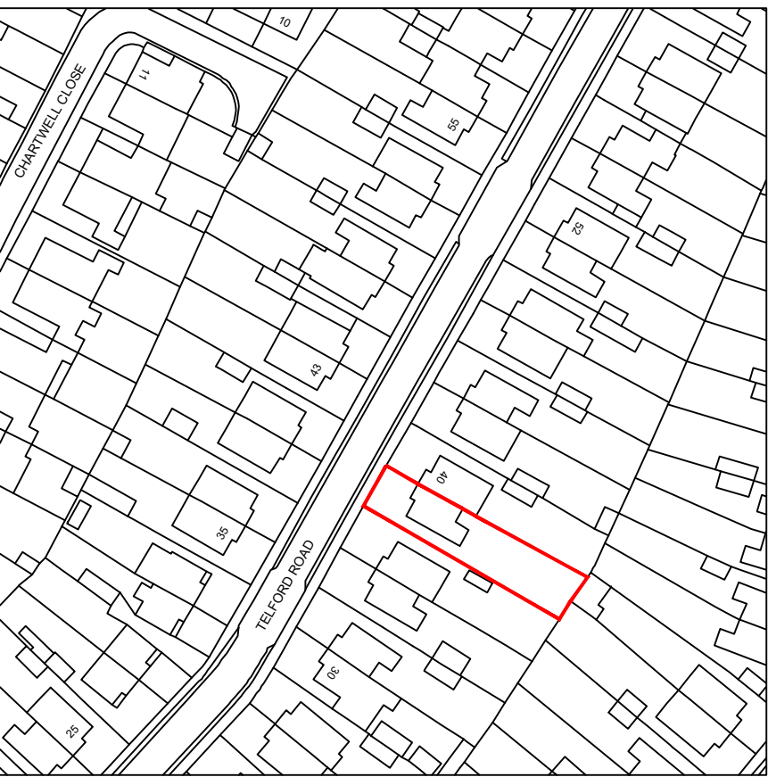
EXISTING SITE LOCATION PLAN SCALE 1:1250