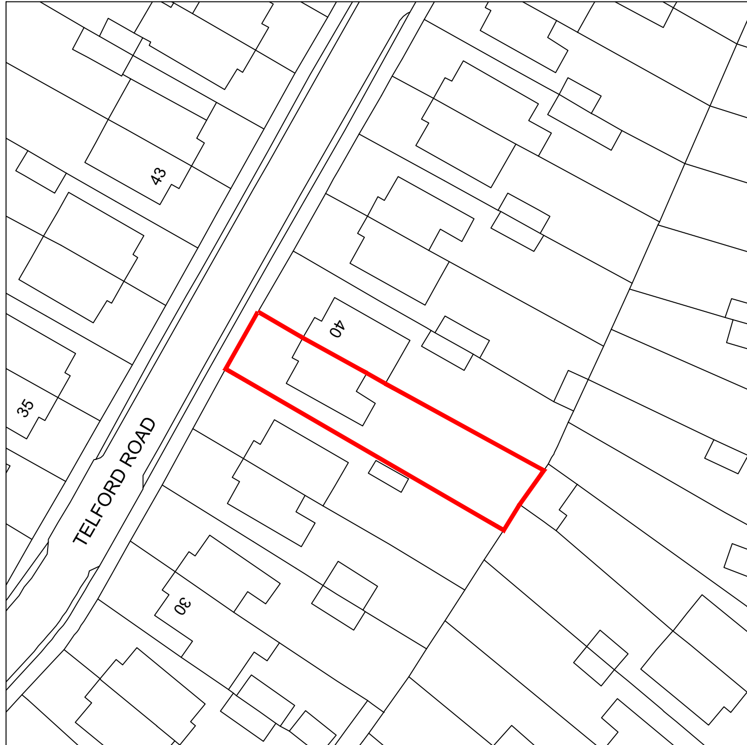
EXISTING BLOCK PLAN SCALE 1:500