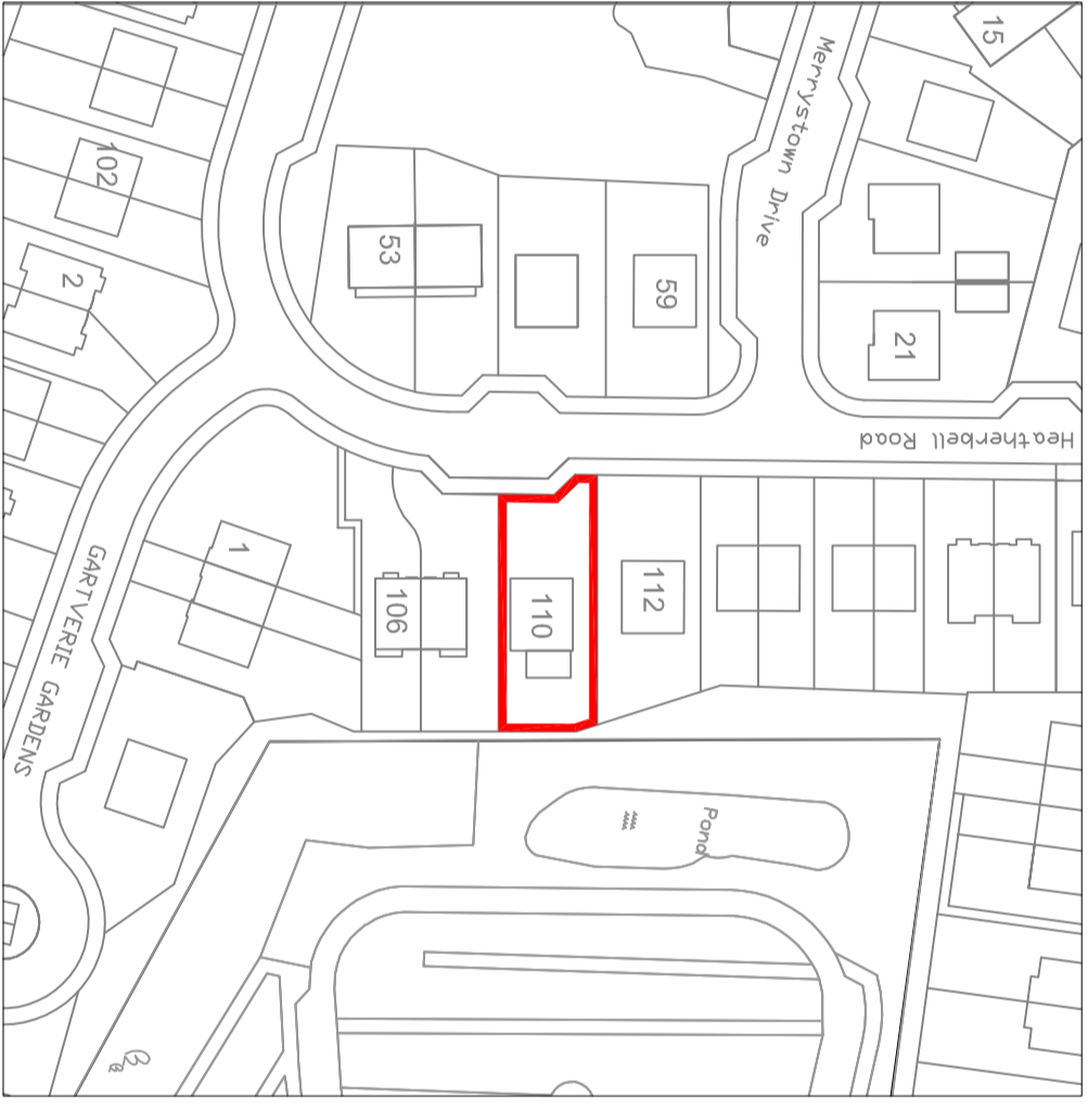
LOCATION PLAN 1:1000