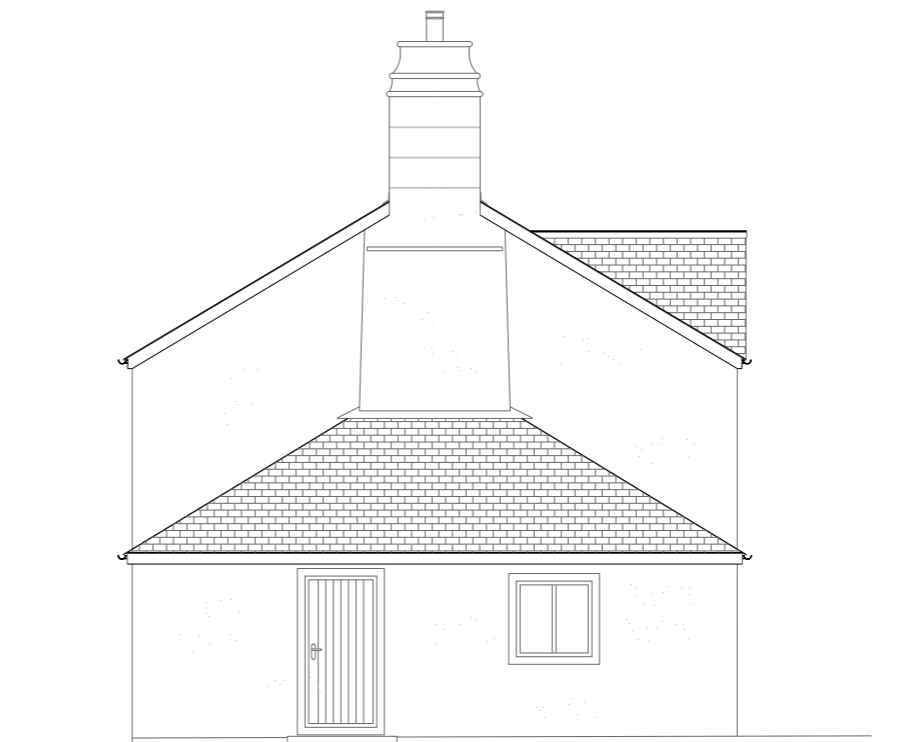
Side (N) ELEVATIONS