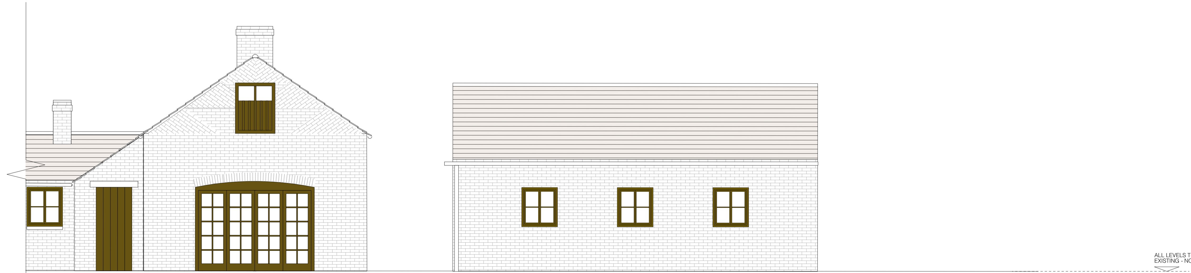
2 LODGE FARM - PROPOSED SOUTH ELEVATION (GARAGE AREA) SCALE: 1:50@A1 // 1:100@ A3