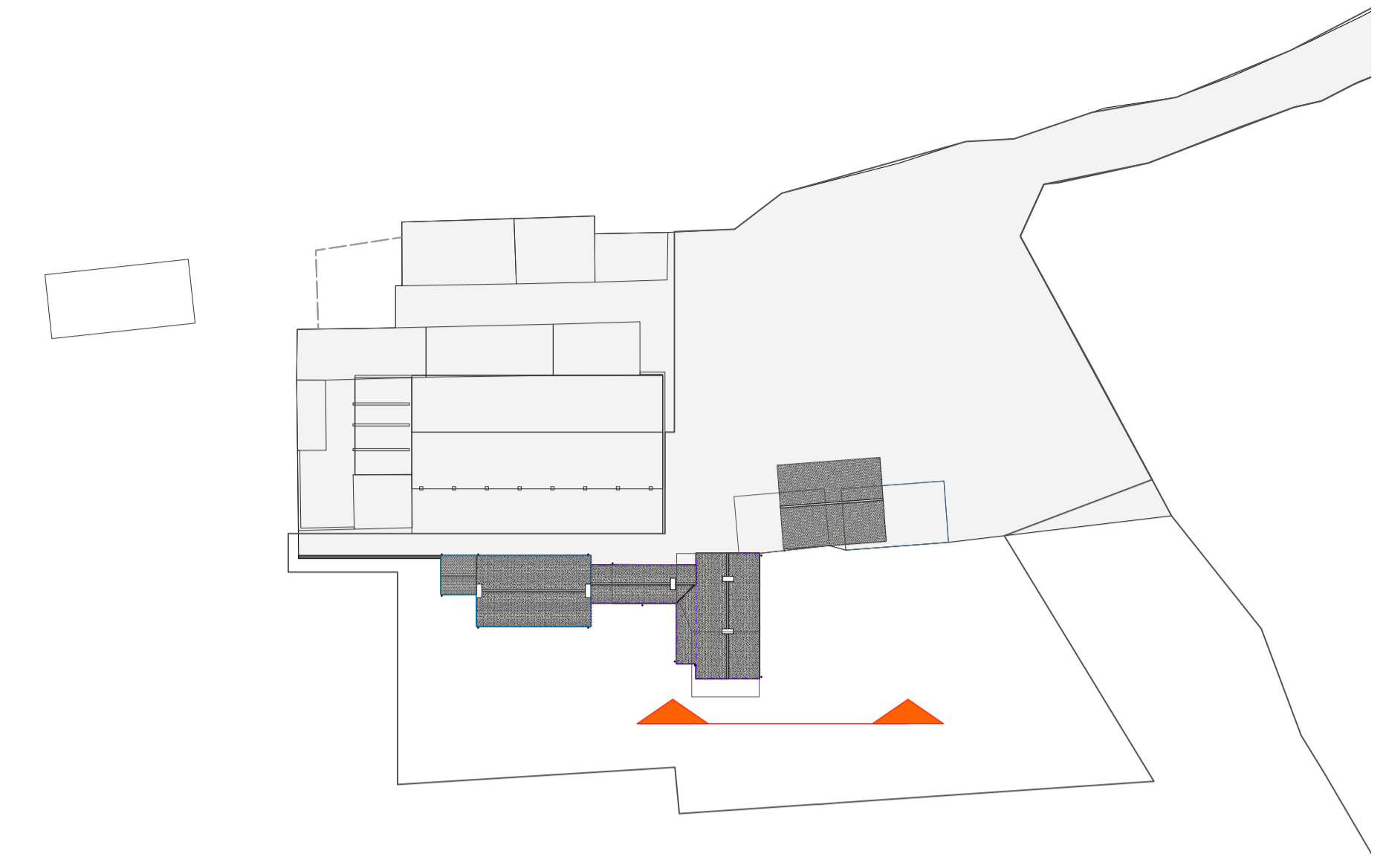
1 LODGE FARM - SITE KEY PLAN SCALE: 1:500@ A1 // 1:1000 @ A3

MATERIALS: ALL STRUCTURE TO BE BRICK BUILT WITH RECLAIMED / NEW BRICK TO MATCH IN WITH FARM HOUSE STOCK. ALL DOORS AND WINDOWS TO BE NEW TIMBER CONSTRUCTION NOTED OTHERWISE ROOF TILES TO MATCH IN WITH TILES TO ADJACENT AGRICULTURAL BUILDINGS.