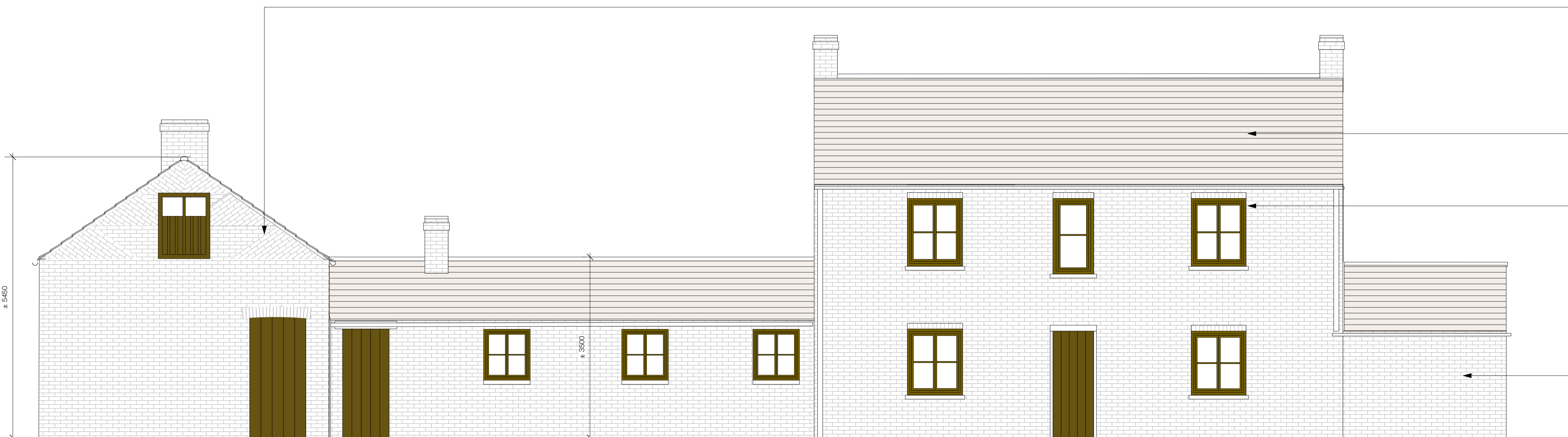
2 LODGE FARM - PROPOSED NORTH ELEVATION (ACCOMODATION AREA) SCALE: 1:50@A1 // 1:100@ A3

DECORATIVE BRICK SETTING OUT TO GABLE ENDS - FINAL LAYOUT TO BE DETERMINED ON APPROVAL - SHOWN FOR ILLUSTRATION ONLY