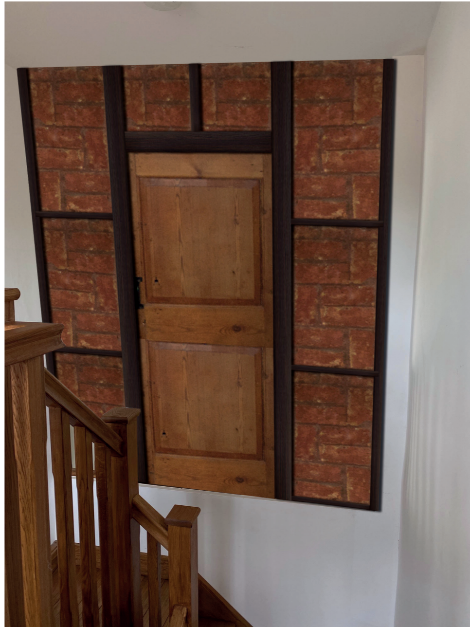
▲ Proposed location