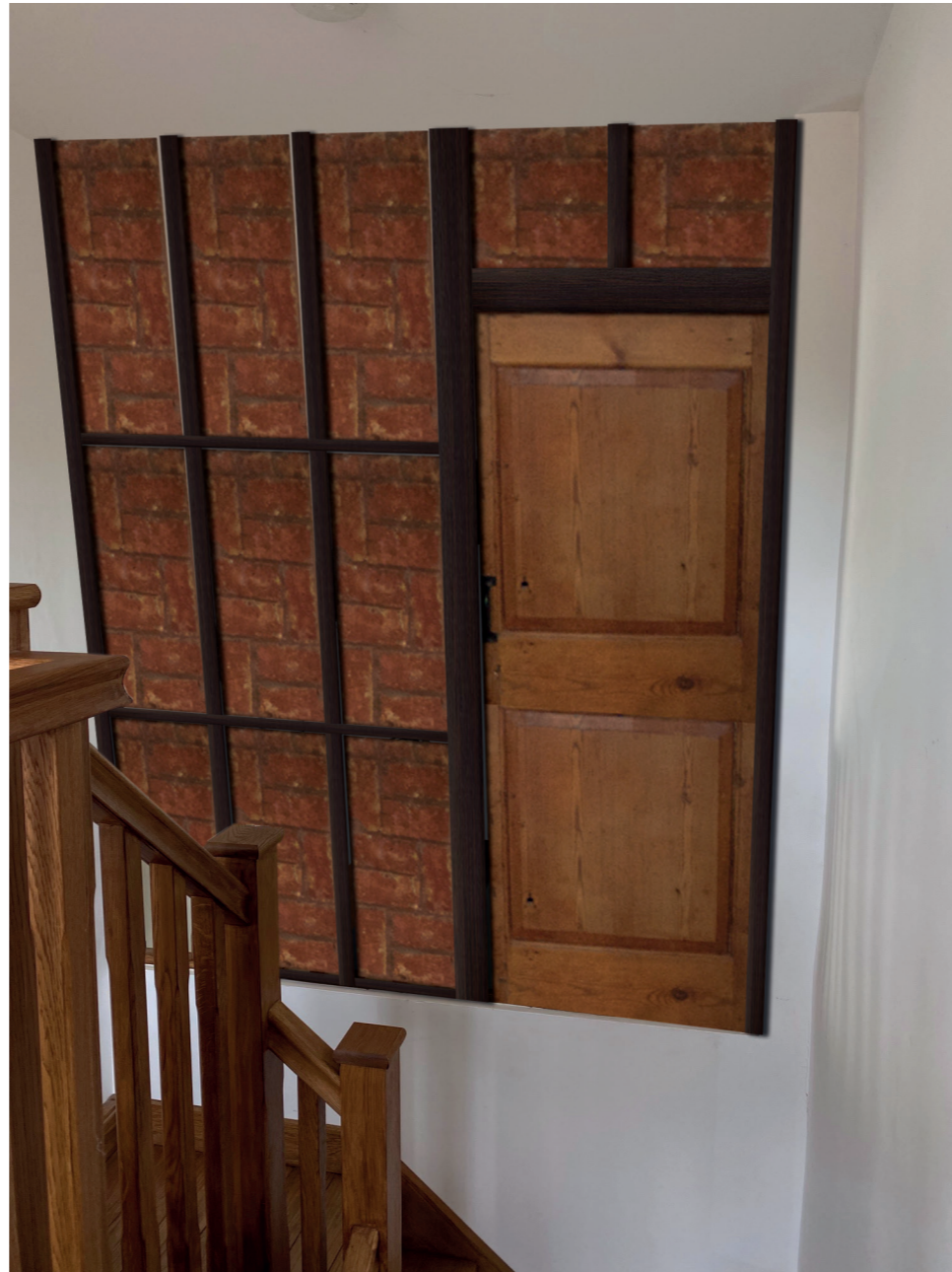
▲ Proposed location