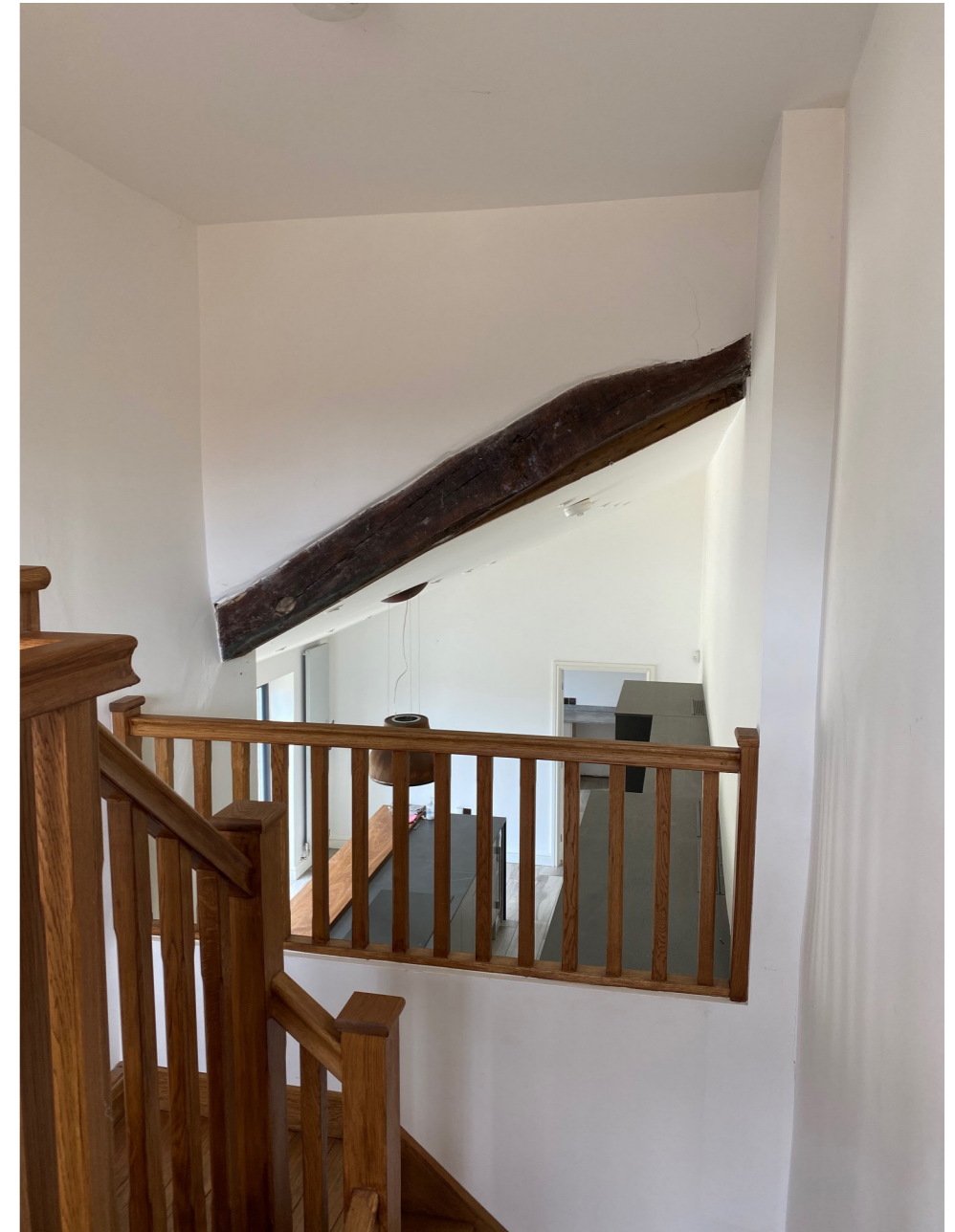
▲ Existing location