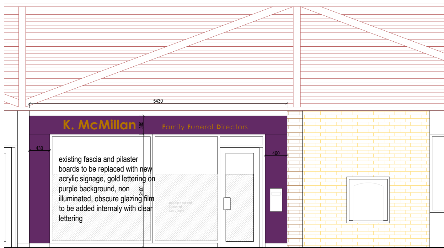
FRONT ELEVATION PROPOSED 1:50