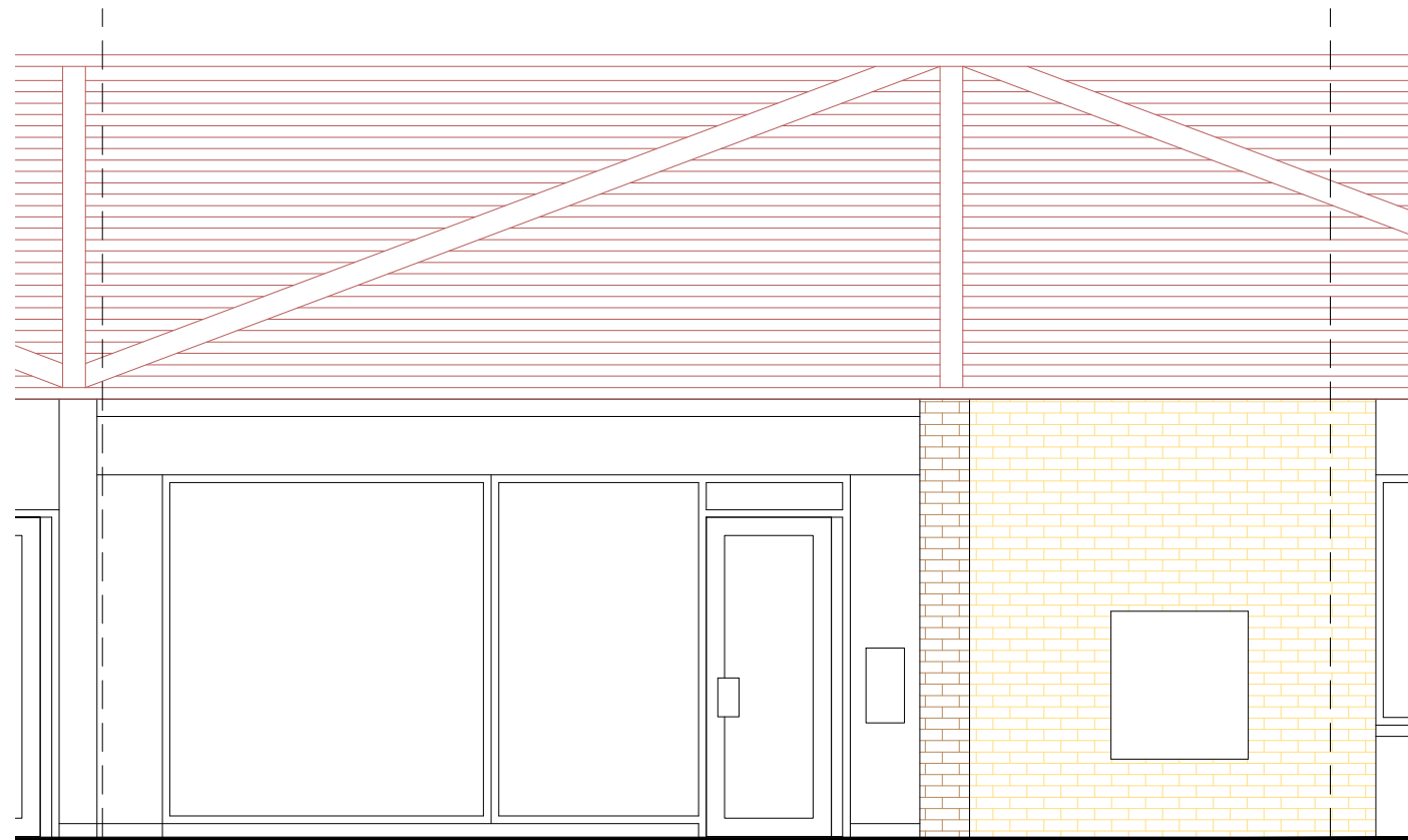
FRONT ELEVATION AS EXISTING 1:50