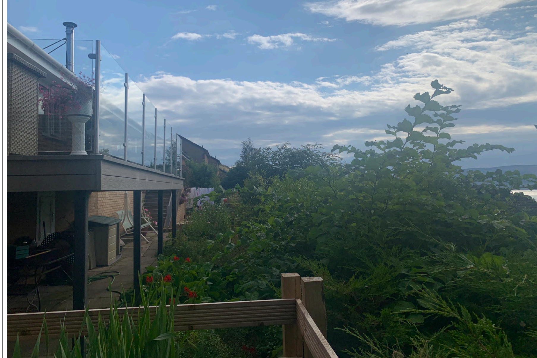
3. IMAGE TAKEN FROM BALUSTRADE EDGE LOOKING WEST