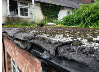
Existing Roof to be replaced

3 Existing Cellar to be cleaned of debris and hatchway secured from Tenant access