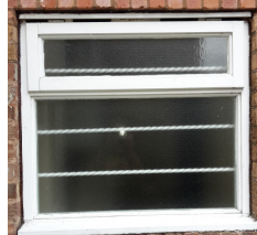
Existing Yard Window