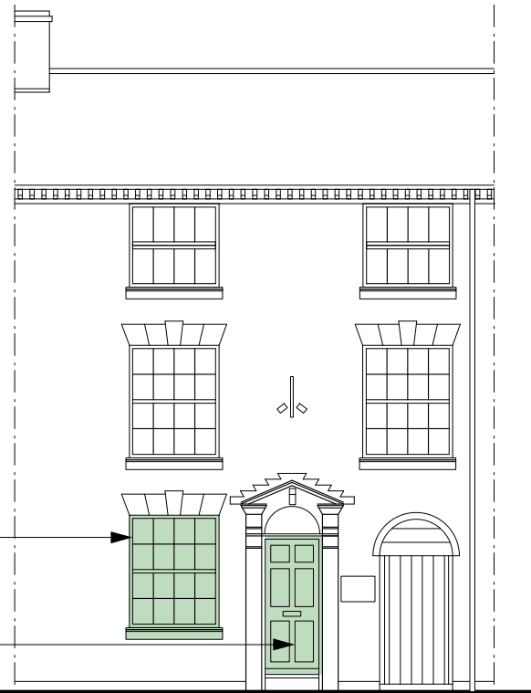
Proposed Front Elevation Scale 1:100

2 Timber Front Door to be altered (see joinery drawing L008)