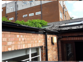
Existing Roof to be replaced