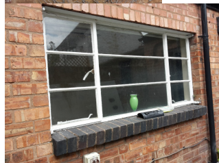
Existing Yard Window to be replaced