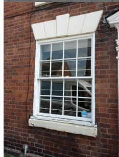
Existing Sash Window to front