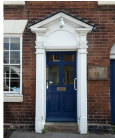
Existing Timber Front Door