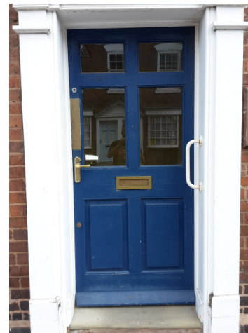
Photograph of Existing Front Door