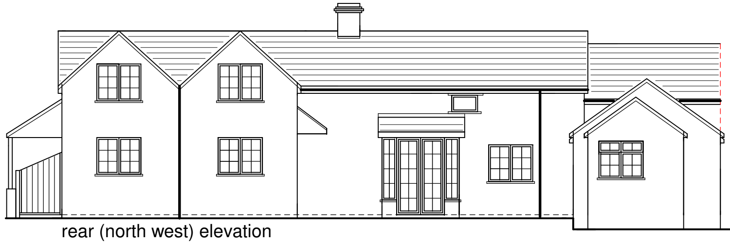
rear (north west) elevation