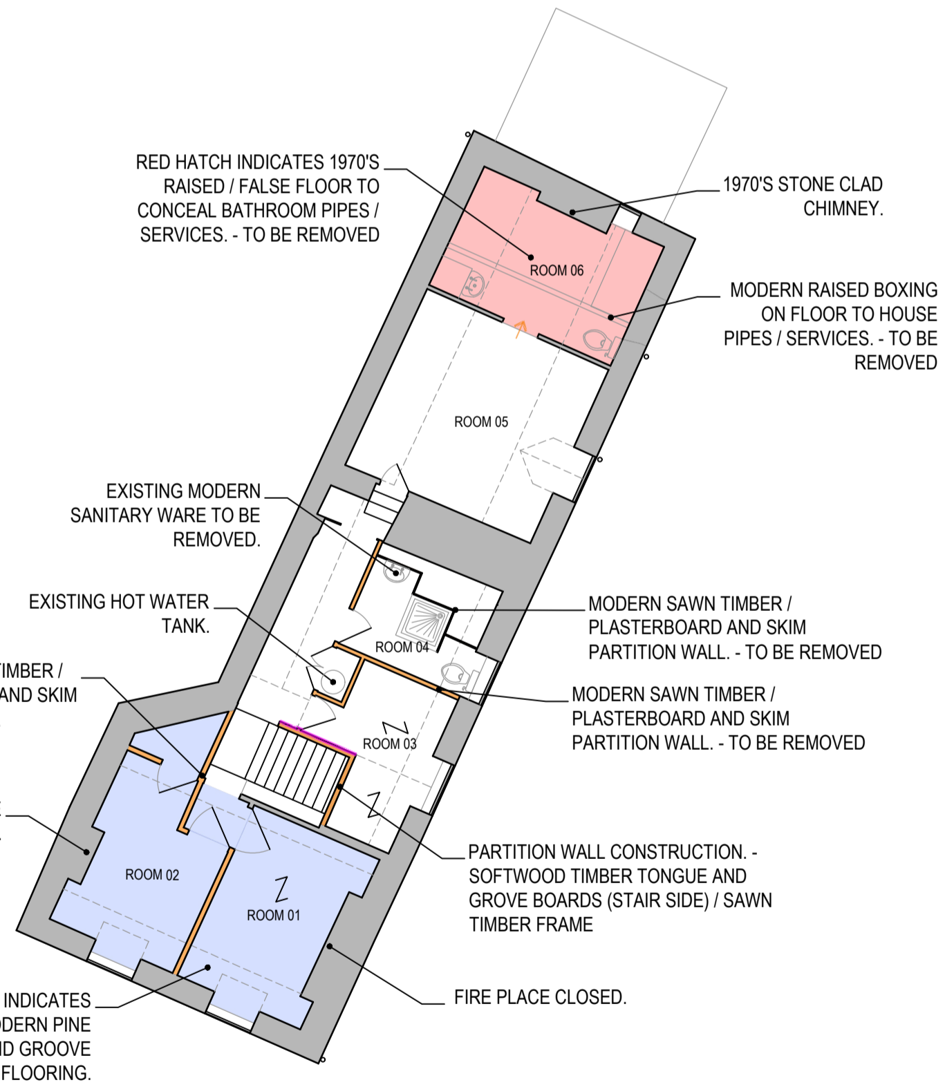
FIRST FLOOR PLAN SCALE - 1:100