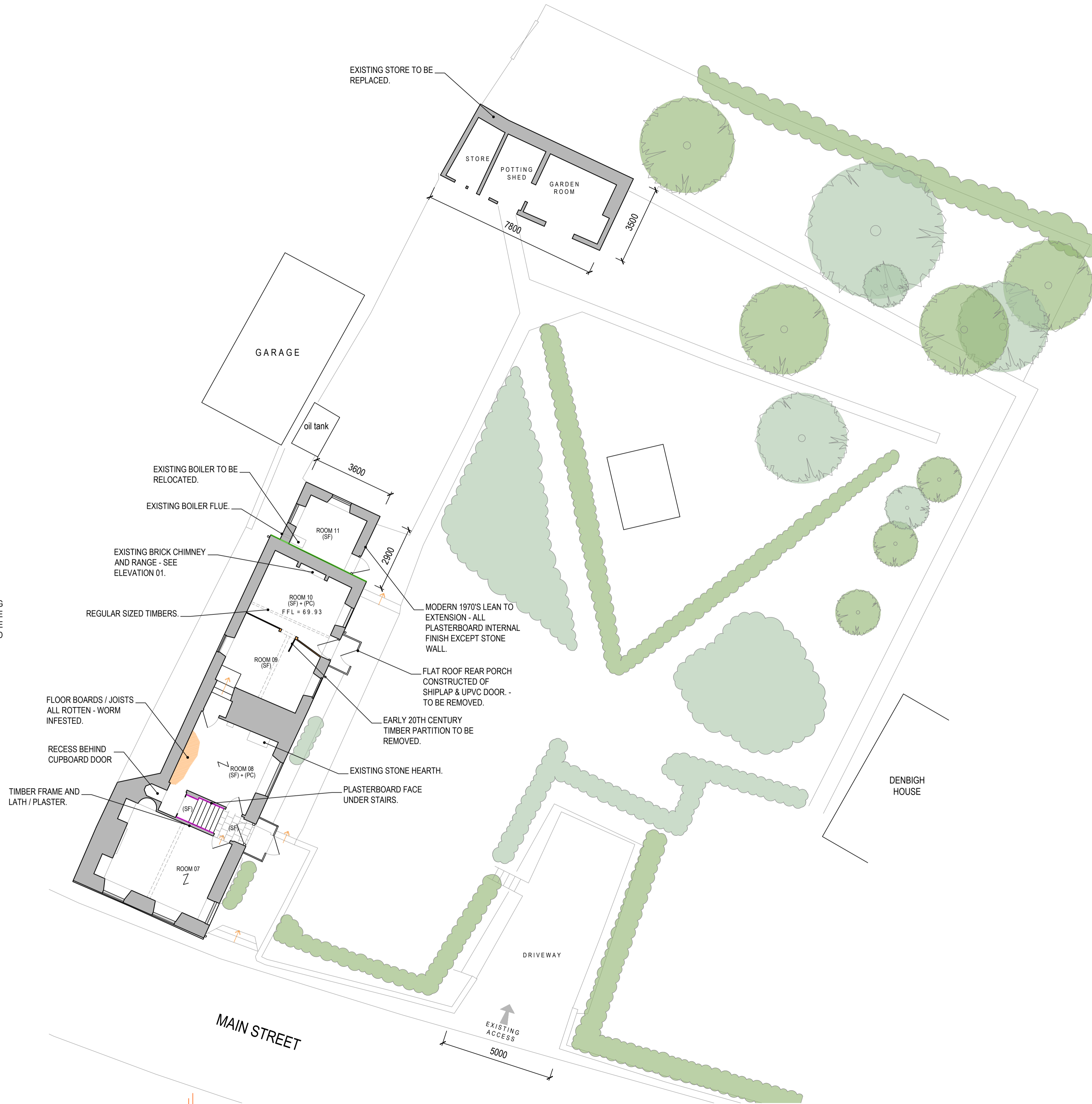
GROUND FLOOR PLAN SCALE - 1:100